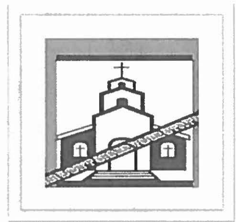
Figure 4. Public Silence on HIV: Church Culture

Public Silence on HIV. A subtheme for challenges was public silence of HIV , which frustrated participants, because they knew the threat for HIV was very real. For example, some participants agreed that silence existed in the church and especially from the pulpit. The perception was that some pastors remain silent because of the effect on many aspects of church culture. For example, participants discussed hidden sexual practices that take place among parishioners placing them at risk for contracting HIV, starting with “deacons and musicians in the church” . Figure 4 was a photograph of