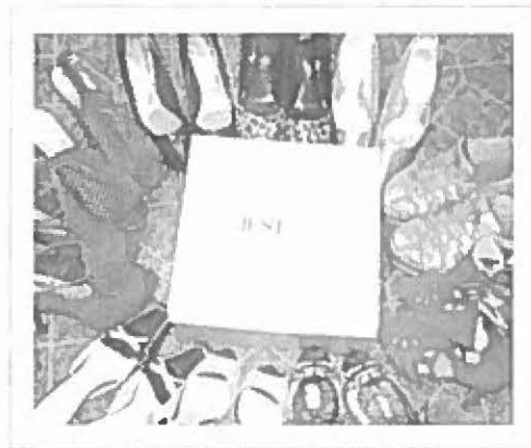
Figure 1. Empowerment: “these are not just the shoes that I have, but these are the choices I have made”

Figure 1, the photograph below, displayed a participant’s empowerment through acceptance of her diagnosis. The participant stated that she had awareness of how past decisions affected her current state, and showed determination for “walking in that truth” (e.g. accepting the diagnosis) by displaying various types of shoes that she owns. Another participant described being responsible in her