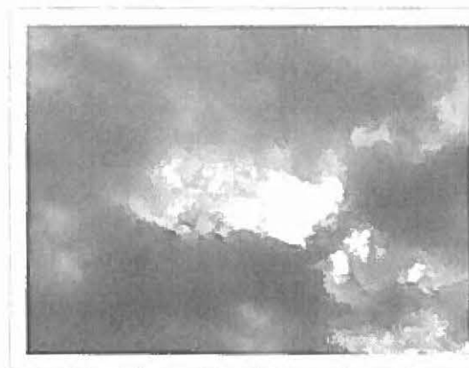
Figure 2. Spirituality: God's presence never leaves

Spirituality. The second major theme for supports was spirituality , which appeared in multiple “Journals of Life”. Images for spirituality were study bibles, sunny skies, and a mirror depicting a relationship with a loving God. “You can look in the mirror plenty times a day and you see something else but always base your thinking on how God sees you or the potential that we have in us that God sees” Other visuals were cups with positive quotations, wall plaques, and