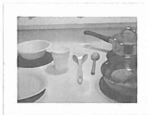
Figure 3. Stigma: Fear and lack of HIV education cause stigma

Stigma. The first theme for challenges was stigma. In " Picturing Life ", the definition of stigma was fear of rejection and judgment related to being WL-HIV and included the recipients' anxiety over contracting HIV from the person disclosing. This anxiety may connect to an actual threat but often the reaction is erroneous. The WL-HIV discussed