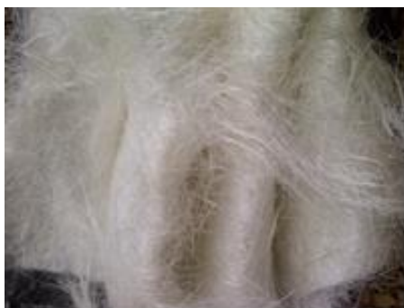
Figure 1. Glass Fibre

Fibres: The glass fibre was obtained from Manweb Nigeria Limited located in the Industrial Area in Ikeja, Lagos Fig. 1. The glass fibre came as a mat and had to be plucked down to the required fibres. Sisal rope was obtained from a local store Fig. 2. The sisal fibres had to be untwined to obtain the individual fibres required for the experiment.