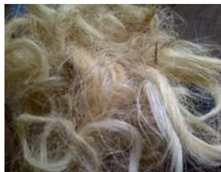
Figure 2. Sisal Fibre