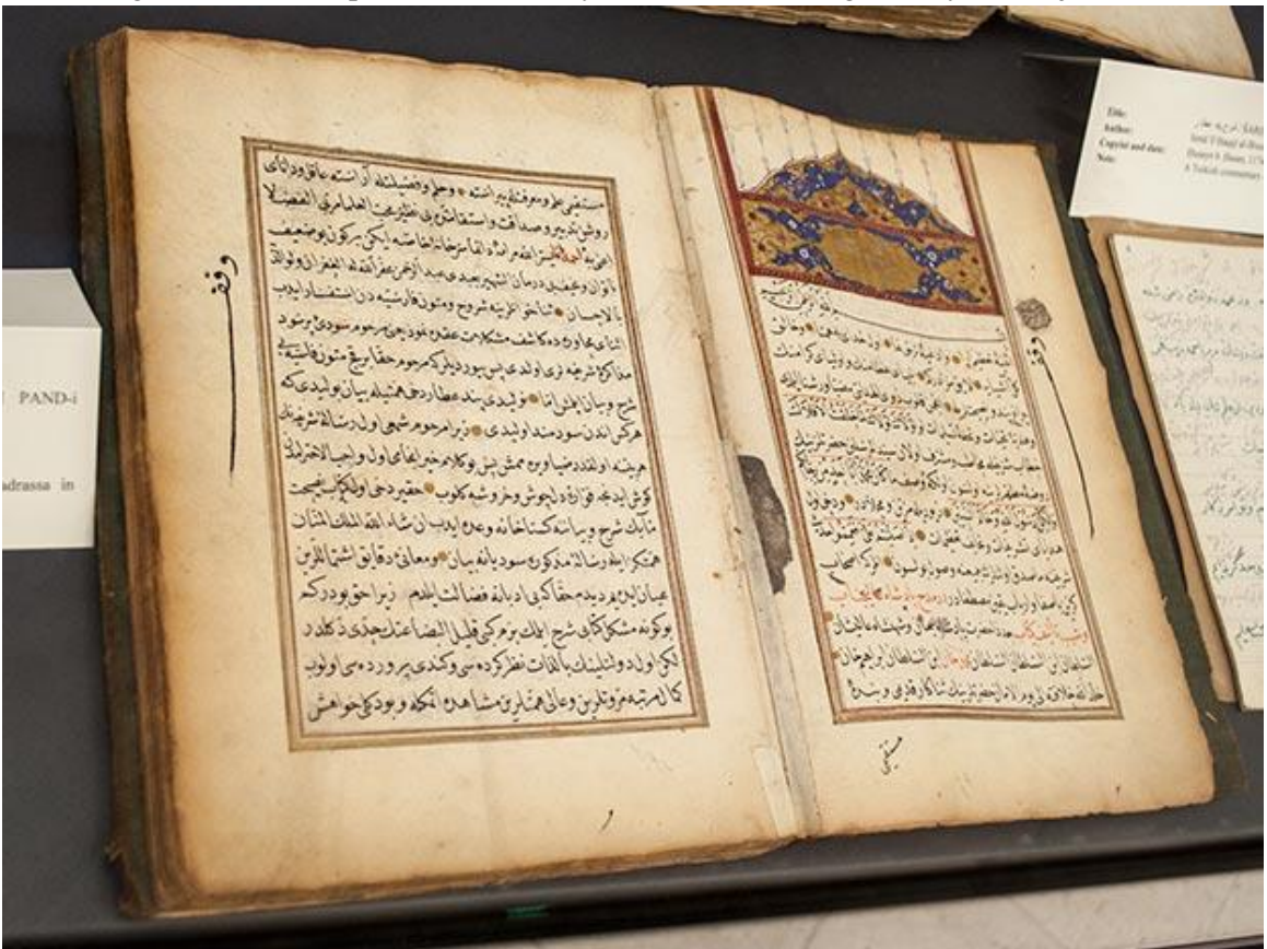
Figure 1. Manuscripts from the library of Gazi Husrev-beg Library in Sarajevo [2]