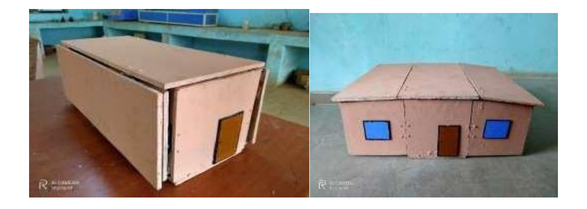
Fig 1 folding house before installation

The folds themselves have been relieved of their structural responsibility to the house as a whole. The folds sit on and hang from the frame members. A regular grid has been created. However, based on the position of the folds and how they have been shifted, the grid can adapt. Frame members can be moved orremoved all together. The frame is always exterior. As the folds slip past and between the frames, so do the enclosures. The next layer of folding is at a smaller scale than that of the main folds. Each frame is provided with hinges and when a fold slips into another it joins like a interlock and is then screwed and bolted .The frame is made of galvanized steel structures. The panel walls are made up of sandwich panel which are embedded with facilities for electricity, water supply and to place furniture .The plumbing is prebuilt, but we need to join the outside the water system and septic tank. PPR and PVC water supply and drainage pipe with fittings are provided. The subfloor is given by fibre cement board .Bathroom floor is provided by PVC floor. Additional plastering can be provided for finishing .The structure is fitted in the concrete stakes for stability. The window is made up of Aluminum alloy double-layer hollow glass window with screens and the door is of Aluminum alloy double-layer hollow glass door. Fig 1 and 2 shows the model made by plywood