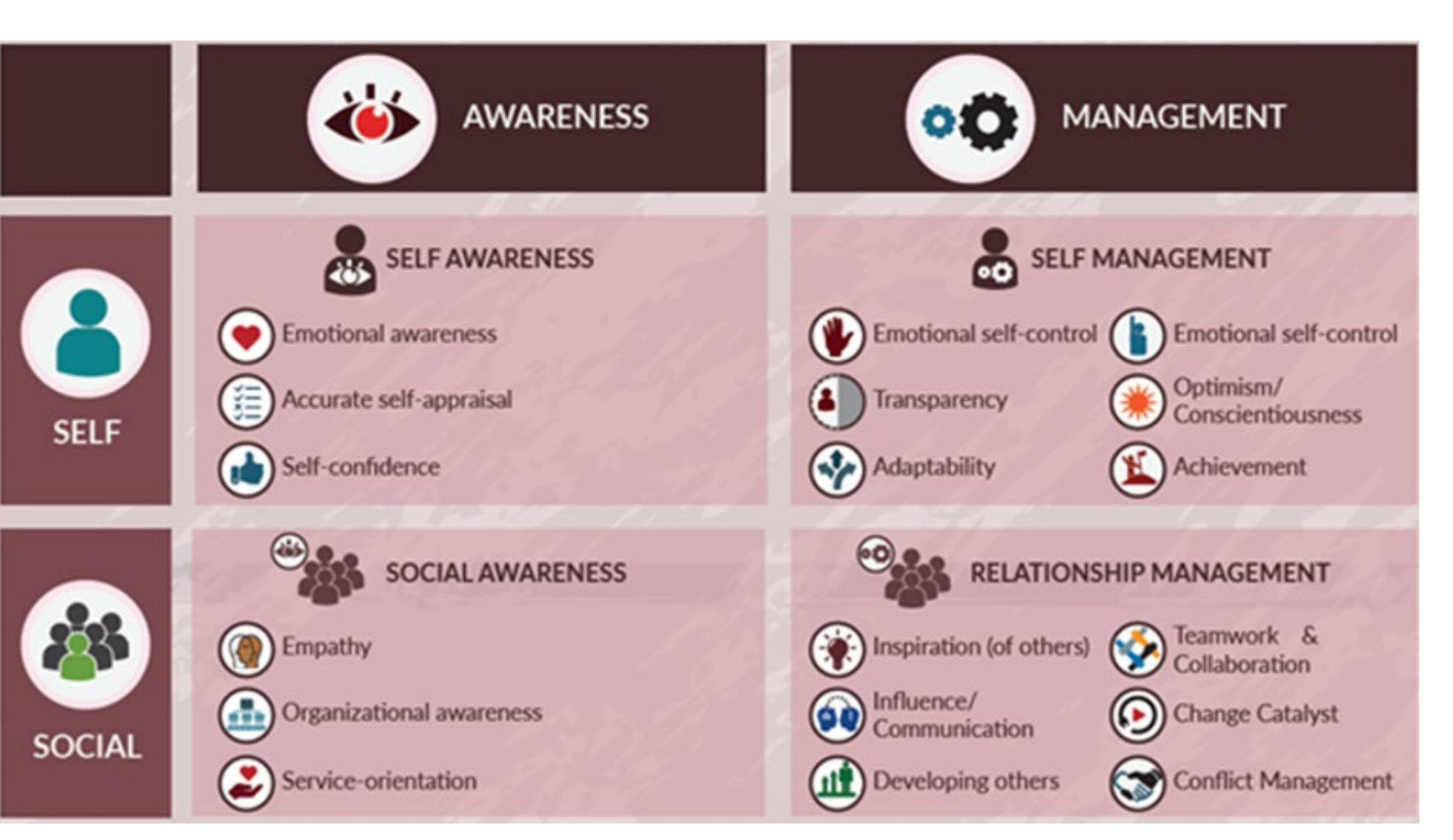
Figure 1: Four Domains of Emotional Intelligence adapted from Daniel Goleman's Book Primal Leadership<sup>16</sup>