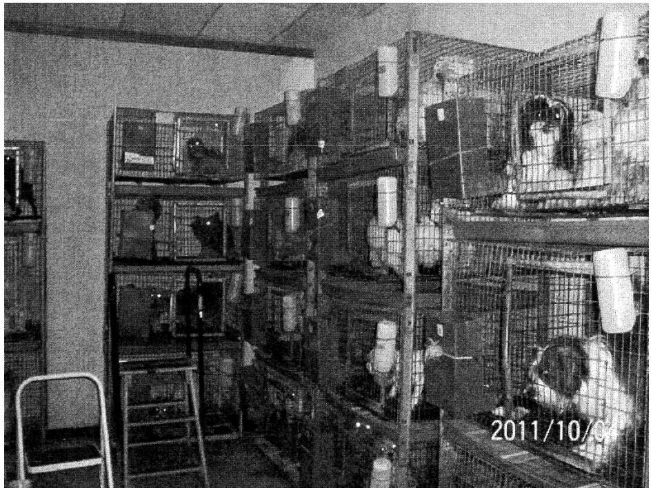
State inspectors documented adult breeding dogs stacked in cages three to four high in the back room of Puppy Parlor in October 2011. The photos were taken during an outbreak of Parvovirus which killed at least 6 puppies.

In October 2011, according to records obtained from the Illinois Department of Agriculture, 105 dogs (60 adults and 45 puppies) at Puppy Parlor were placed under quarantine due to an outbreak of canine Parvovirus – a deadly disease often associated with unsanitary and unhealthful living conditions. At least six puppies died from the deadly virus.