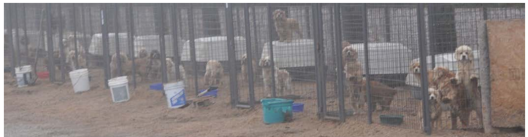
Note the lack of shade in these enclosures at the Ratzlaff's kennel.

USDA violations documented at the Ratzlaffs’ kennel include a dog with hair loss and