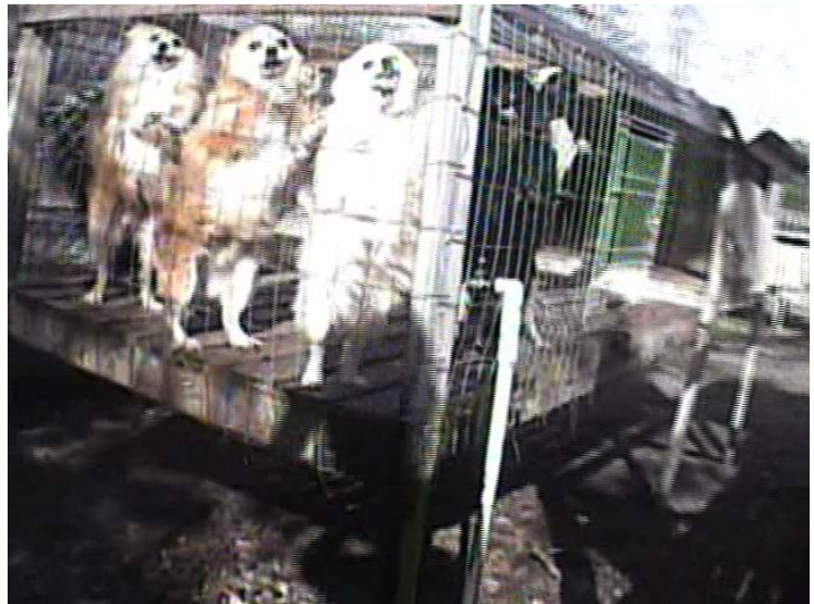
An HSUS investigator took this photo at K-Bar Kennels in 2009. State authorities placed the kennel under temporary quarantine for two different outbreaks of Parvovirus, but declined to shut it down.

In December 2009, an HSUS investigator visited the kennel undercover. The report and records were sent to local law enforcement. “K-Bar Kennels in Georgia stands out in my memory as one of the worst puppy mills I’ve seen in all my years looking at puppy mills,” the HSUS investigator recently recalled. “The collection of ramshackle, rundown structures included filthy raised rusted metal cages with uncoated wire