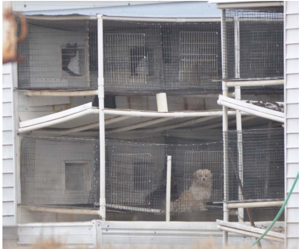
Dogs in small, stacked cages at Rainbow Ranch Kennel were seen gazing out at open, grassy plains in which they could not run and play.

In September 2011, Rainbow Ranch received an Official Warning from the USDA for violating the Animal Welfare Act regulations. This warning cited six non-compliances from different inspections during the years 2009-2011, including a direct noncompliance for failing to provide veterinary care. This issue refers to a June 2011 inspection where the inspector found ten animals in need of immediate medical attention: a Chihuahua who “has a sagging appearance to his lower jaw,” five boxers and a pug that “have wounds at the base of the ears” with flies buzzing around them, a schnauzer that had a wound on the left side of his body that oozed a “thick, bloody discharge” when the inspector palpated it, a Boxer with “patchy hair loss on her chest, shoulder areas, and sides,” and an English Bulldog that had a “pink, fleshy mass in the corner of the right eye.”