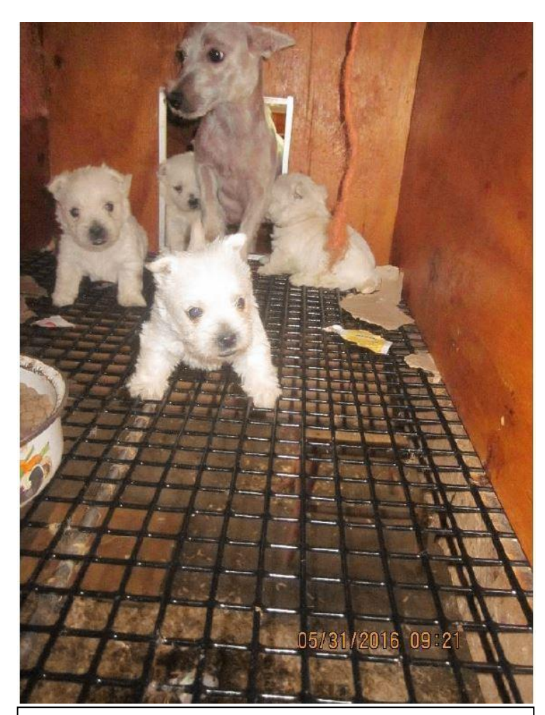
Puppies at the facility of Alvin Nolt in Thorpe, Wisconsin, were found on unsafe wire flooring, a repeat violation at the facility. Wire flooring is especially dangerous for puppies because their legs can become entrapped in the gaps, leaving them unable to reach food, water or shelter.

The year 2017 has been a difficult one for puppy mill watchdogs. Efforts to get updated information from the United States Department of Agriculture (USDA) on federally-inspected puppy mills were severely crippled due to the USDA's removal on Feb. 3, 2017 of all animal welfare inspection reports and most enforcement records from the USDA website. As of April 20, 2017, the USDA had restored some animal welfare records on research facilities and other types of dealers, but almost no records on pet breeding operations were restored.