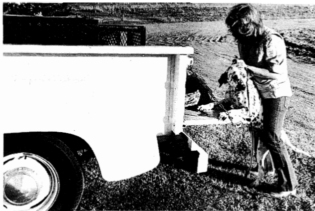
Top-loading truck used previously in Wichita Co.

the vehicles be replaced, and that was the boost the county needed to make the change.