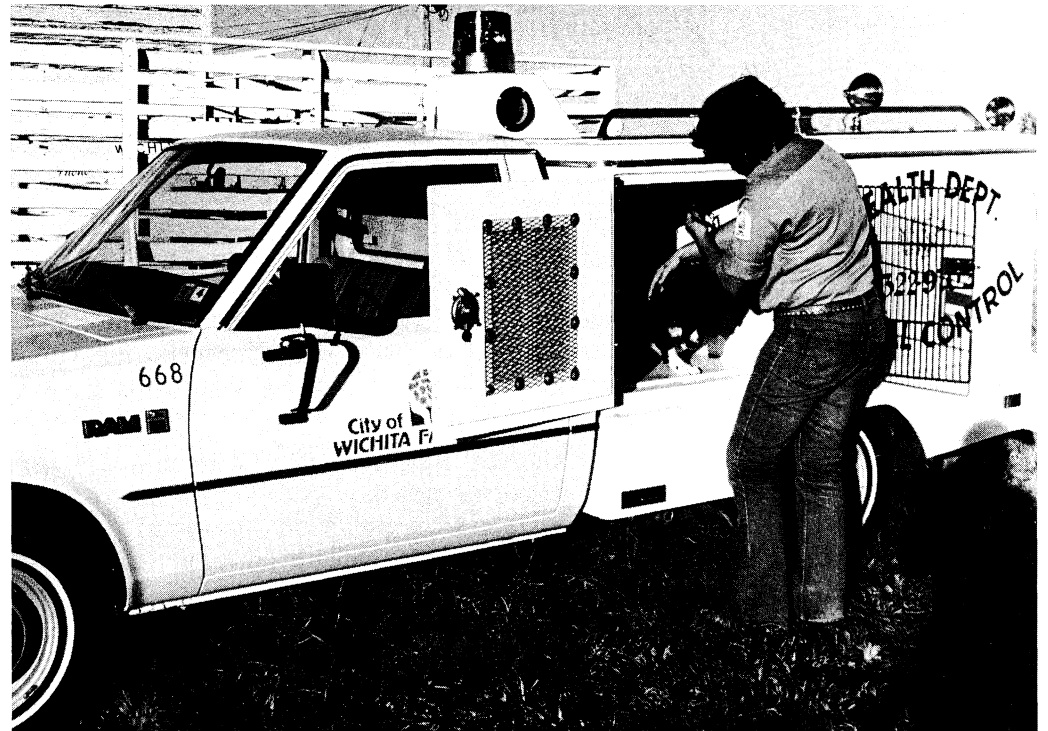
New vehicle for Wichita Co. ACOs.

For the people who care about community animal control