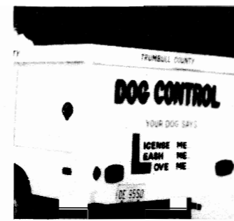
Well-marked vehicle from Trumbull Co., OH.

If possible, each driver should be given a briefcase for carrying the daily log, violation tickets and educational materials to hand out. You can also build a small rack for the truck to keep handouts separate and clean.