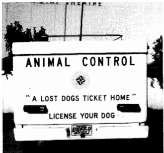
Many agencies use vehicle surfaces for educational messages. Above, from High Point, NC.

SHELTER SENSE is published by The National Humane Education Center, a division of The Humane Society of the United States, 2100 L St., NW, Washington, DC 20037, (202) 452-1100.