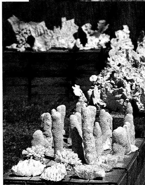
Right: Coral reefs contain a vast diversity of life. Above: Coral displayed for sale has been taken from a vulnerable ecosystem.

When will we have had enough? What will it take to awaken the leadership of our nation in order that these animals will be given the consideration and resources they need to survive?