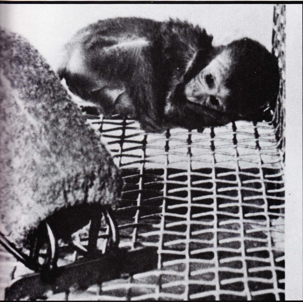
UNIVERSITY OF WISCONSIN PRIMATE LAB

This rhesus monkey raised with a cloth-covered surrogate mother was one of the subjects studied by Dr. Harry Harlow and his colleagues at the University of Wisconsin Primate Laboratory.