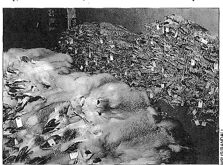
Above: Dozens of fox and bobcat pelts lie stacked and tagged. Opposite: A coyote in a steel-jaw leghold trap awaits its fate. Thousands of predators in the West have been exterminated in a federal program that has cost millions of dollars.

Over the years there have been small changes in the way federal predator control is conducted, but even those minor reforms