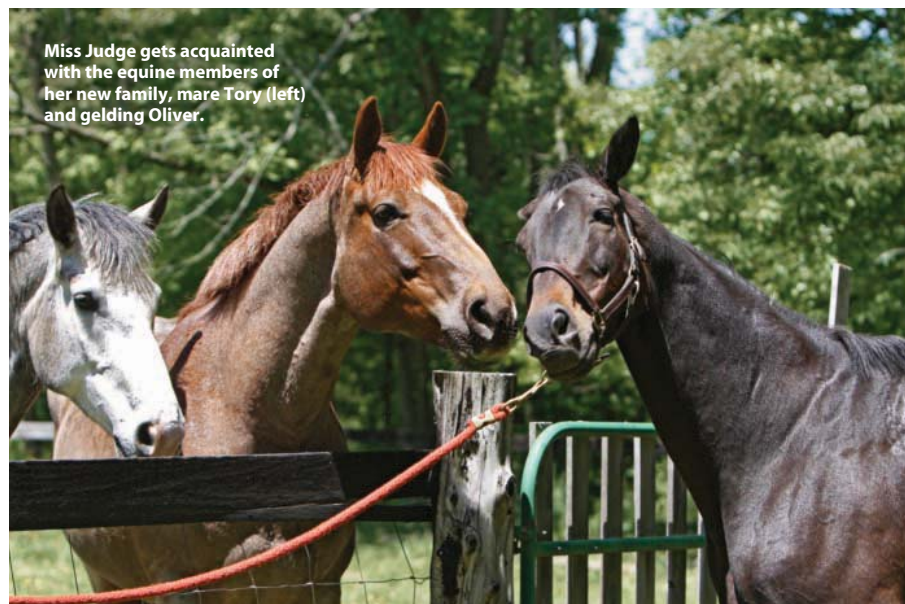
Miss Judge gets acquainted with the equine members of her new family, mare Tory (left) and gelding Oliver.