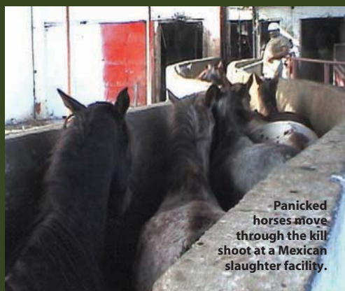
Panicked horses move through the kill shoot at a Mexican slaughter facility.

If you're pining for more horse time but aren't sure you're ready for the responsibility, take a riding class or volunteer at an equine rescue group. Before you commit to the investment it takes to be a good equine companion, make sure your horse fever isn't just a 24-hour bug.