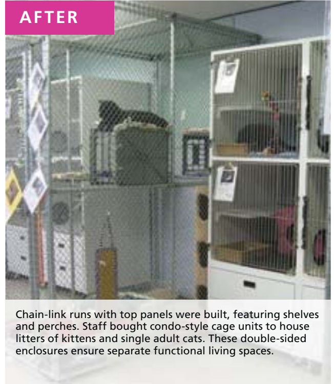
Chain-link runs with top panels were built, featuring shelves and perches. Staff bought condo-style cage units to house litters of kittens and single adult cats. These double-sided enclosures ensure separate functional living spaces.

long term, the physical environment must include opportunities for hiding, playing, resting, feeding, and eliminating. For cats, the environment should also allow for scratching, climbing and perching.”