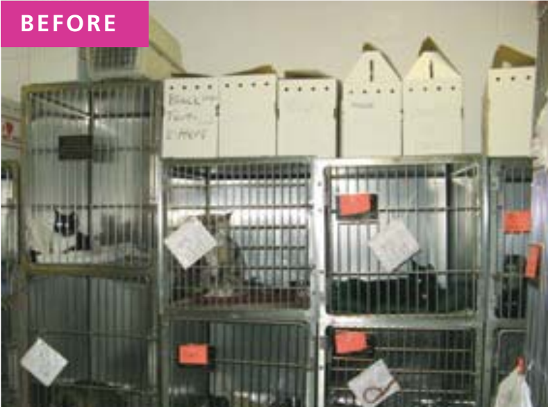
The shelter's cat adoption area consisted of an assortment of steel and wire cages stacked high along the walls, which obstructed windows and compromised lighting. An additional row of cages created a center aisle, making the room feel cramped and stuffy—a recipe for stress.