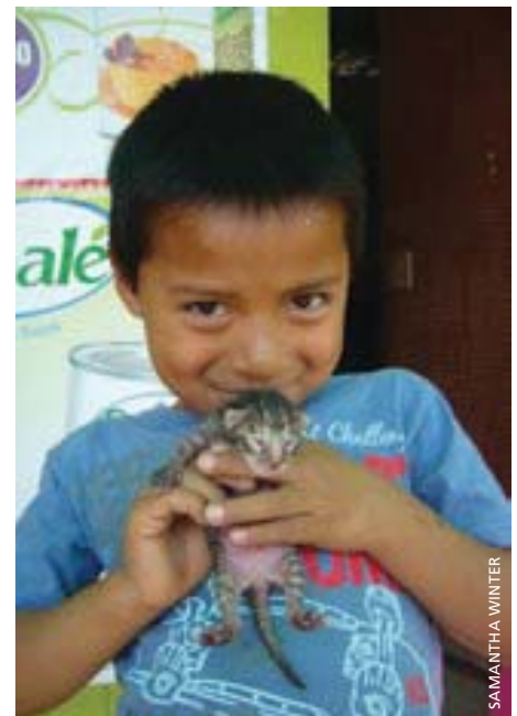
The very idea of an animal shelter is often a foreign concept to people who are struggling themselves just to get by. But this little boy seems very taken with a tiny kitten at the site of a mobile clinic run by Animazul, an animal shelter located about an hour outside Lima.