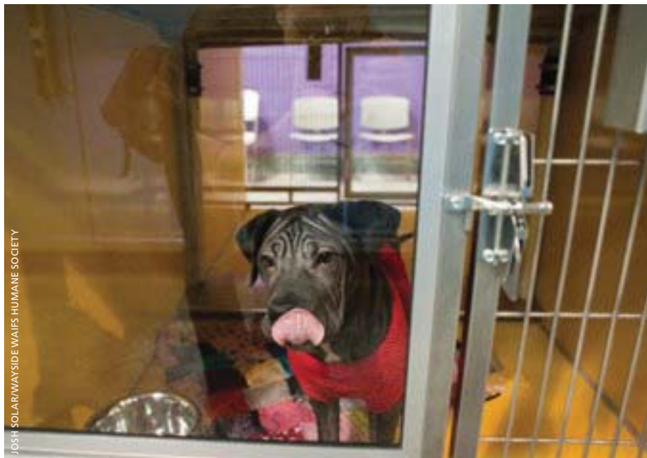
The shiny, new glass-front kennels at Wayside Waifs Humane Society create a terrific showcase for dogs awaiting adoption, like this handsome shar pei mix.