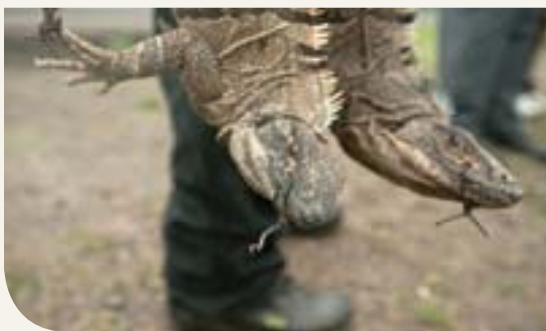
Black spiny-tailed iguanas, mouths sewn shut, are sold for meat on Managua’s outskirts. A spider monkey dangles from a seller’s arm along the Pan-American Highway.

An untold number of animals illegally depart the country on flights, hidden in false-bottomed suitcases or lengths of PVC pipe taped to passengers’ bodies like drugs. Others trickle across Nicaragua’s borders via the Pan-American Highway into Honduras or Costa Rica. Often they end up in El Salvador, which has few forests and little wildlife left but serves as a major transshipment point for traffickers. From there, animals are sent to the United States, Europe, and Japan, where the most sought-after parrots can each bring $1,000, $2,000, or more. Andrés Gómez Palacios, deputy commissioner of the Nicaraguan police’s Division of Economic