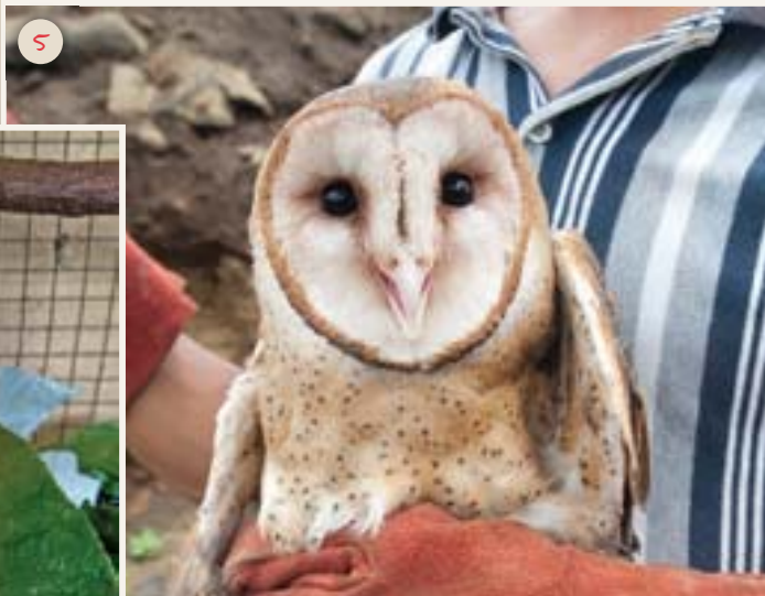
At the rescue center: White-faced capuchin monkeys (1) live for now in a cage but are on their way to release. Rarely seen in Nicaragua's forests these days, a scarlet macaw (2) is so sought after by poachers that just one place in the country is safe for its release: an island with no bridges to the mainland. Mealy parrots (3) are more common, but their populations are also in decline. A juvenile two-toed sloth (4) was among the baby animals who poured into the center in early 2012. Perched in a gloved hand, a barn owl (5) readies for a flight that will test whether he is prepared to return to the wild.