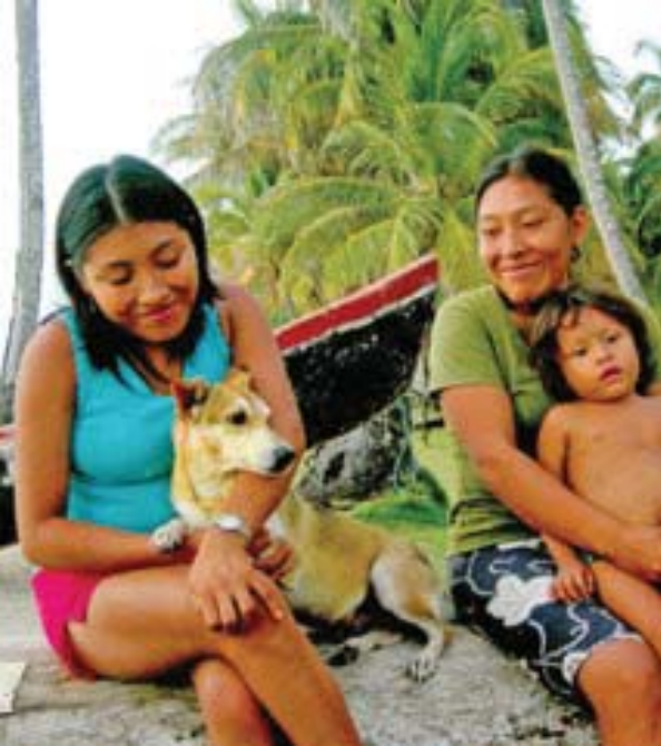
A Kuna woman enjoys a moment on the waterfront with her beloved dog Estrella, or Star, on one of the San Blas Islands in the Caribbean.

And yet a comment I've repeatedly heard from tourists is: "All these loose dogs. No one cares!"