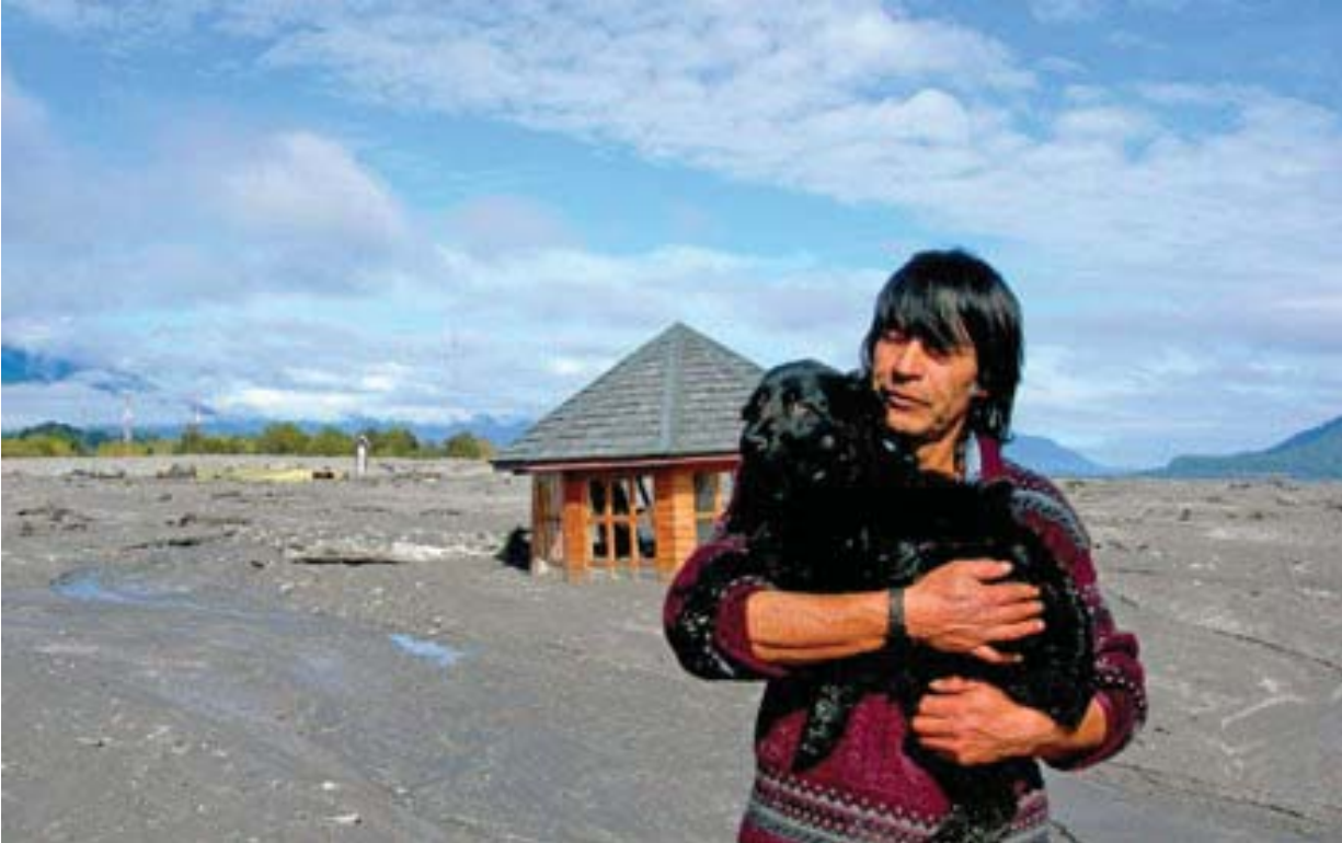
A Chilean man, who lost two dogs during the eruption of Mount Chaiten in 2008, carries 4-month-old Chupeti on an ash-filled harbor. In a situation reminiscent of New Orleans during Hurricane Katrina, the authority known as the Municipalidad ordered residents to evacuate—without their pets. Almost immediately, the first rescue and evacuation of animals in Chile began. The man also cares for Latay and Morocho, two dogs whose owners never returned.