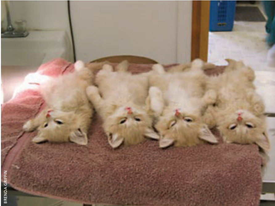
Four male littermates are anesthetized and prepared for surgery. The techniques for performing pediatric spay/neuter are similar to those used in traditional-age patients; special equipment is not required.