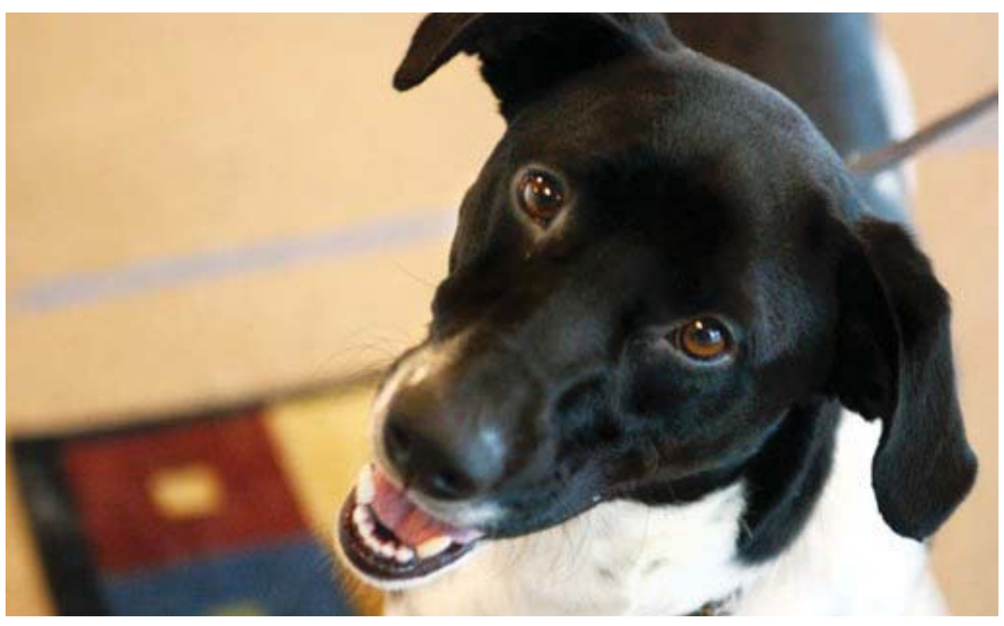
Cooper, a 1-year-old pointer mix, was enrolled in the Humane Society of Boulder Valley's behavior modification program to work on his food-guarding issues. Cooper's face shows the pleasant, anticipatory response staff members look for when working with dogs.

Charlie, a social, wiggly, young miniature poodle mix, was the highlight of my days at the Humane Society of Boulder Valley (HSBV) for a 10-day stretch last spring.