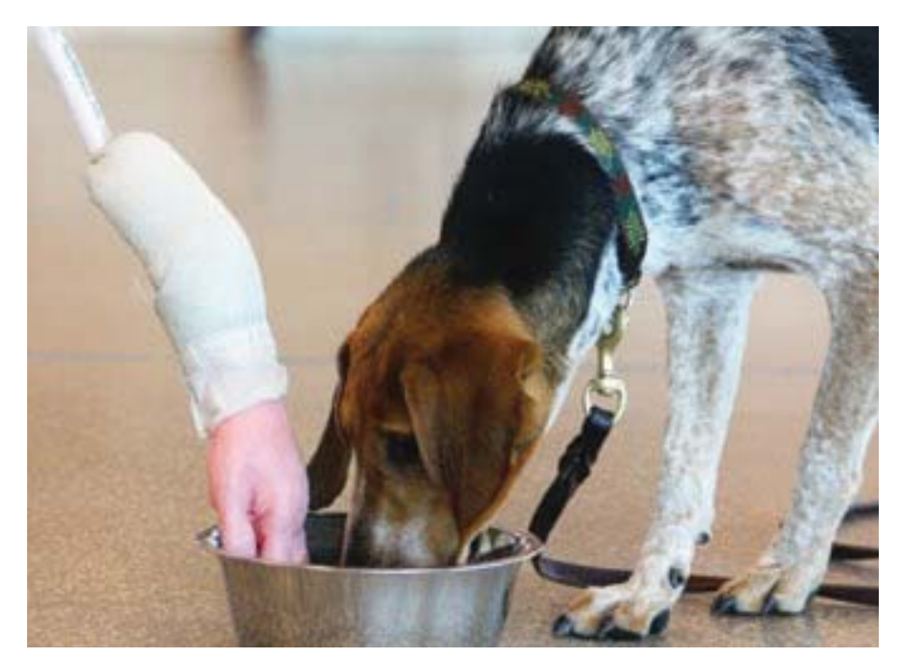
Staff use an artificial limb known as an Assess-A-Hand to help determine a dog's potential for food-related aggression.

To modify the behavior problem, it is worthwhile to consider the biological legacy of dogs and the nature of food-related aggression. Food guarding is one of the most common types of aggression, and indeed, many pet dogs are food guarders.