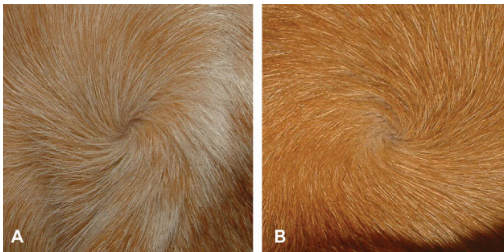
Fig. 1. Photographs of hair whorls demonstrating directionality: (A) a clockwise (right) simple whorl; (B) a counterclockwise (left) simple whorl.

with a left-motor bias during ridden work. Hair whorl characteristics in Canidae have not widely been assessed prior to this two-part study (see Tomkins and McGreevy, in press). Evans and Christensen (1979) made brief reference to hair whorls being located in different regions of the body. Similarly, Pullig (1950) reported different locations in which whorls occurred on related Cocker Spaniels, but to date, there are no known studies investigating canine whorl direction. Therefore, the aim of the current study was to, first, assess the direction of whorls in each of the 11 different regions in which they are found and, second, describe the distribution of whorl directionality in the sample domestic dog population.