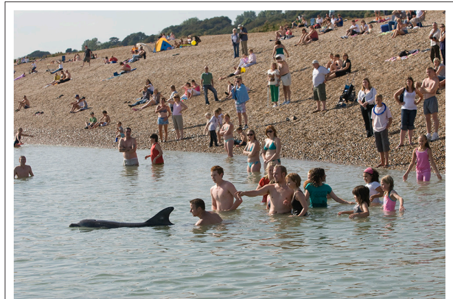
FIGURE 3 | Large numbers of people traveled to see “Dave” and to interact with her.

It is distinguished from Wilke et al.’s Stage 1 animal that has established a home range.