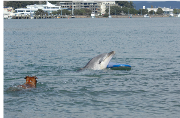
FIGURE 5 | “Moko” with a surfboard he had “stolen” and a dog swimming after him.

There are also cases of solitary dolphins interacting with domestic animals. “Dougie,” in Ireland, for example, regularly interacted with a pet dog who would swim with him every