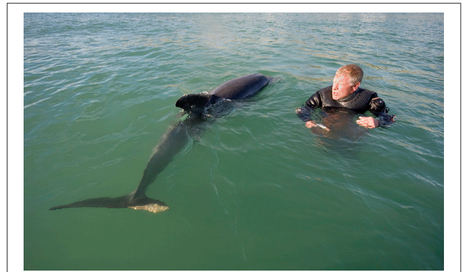
FIGURE 4 | After “Dave” received a severe wound to her tail, attempts were made to give her fish laced with antibiotics.

Bejder et al. (34) noted that when wild animals become habituated to contact with humans it can lead to negative