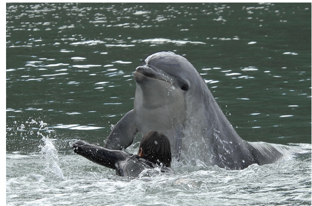
FIGURE 6 | “Moko” being pursued by a swimmer in Whakatane, New Zealand (Photo: Ingrid Visser).

day, 59 “Dolphie,” “Beaky,” and “Simo” in Wales were known to have swum and played with dogs (4) and Figure 5 shows a dog approaching “Moko” in New Zealand.