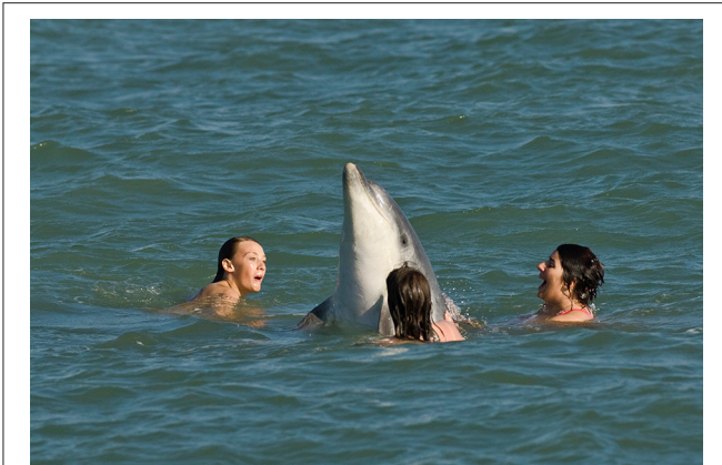
FIGURE 2 | “Dave” the solitary-sociable dolphin, interacting with a group of people in Kent, UK.