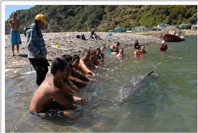
FIGURE 8 | “Moko” the solitary-sociable dolphin interacting with the public under the supervision of his guardian (wearing the yellow cap).

dolphins “Dolphy” and “Fanny” both had guardians who worked alongside local supporter groups and under the supervision of the University of Marseille (23). Some of “Moko”’s interactions with people were monitored by a guardian (see Figure 8 ).