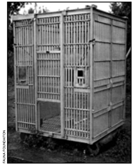
Figure 2. A typical laboratory cage for individually housed chimpanzees.

An analysis of chimpanzee research for the years 2000 to mid-2002 conducted by The HSUS revealed that information about the types of housing provided in publications or in federal grant abstracts was lacking (Conlee, Hoffeld, and Stephens 2004). Among 189 publications 24 percent mentioned social housing and 76 percent did not mention any specific housing type. Overall, information regarding the specific number of chimpanzees maintained in each type of housing (individual vs. social) was not readily available. Housing and environmental conditions, however, can have significant effects on research