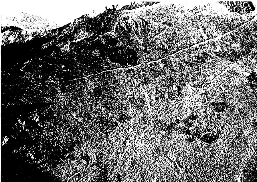
FIGURE 2. Aerial photograph, Olympic National Park.

the animals multiplied rapidly. Hoards of foraging goats decimated vegetation on the island's steep slopes and, in the absence of plant cover, tropical rainstorms washed away much of the topsoil. Today, the island's landscape is barren, and native vegetation survives only on cliffs that are inaccessible to the goats (Holdgate, 1967).