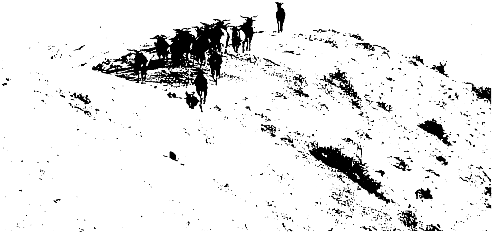
FIGURE 3. Feral goats on Santa Catalina island off the coast of California. Note the lack of vegetation.

herbivores may also affect native fauna. These effects can be direct or indirect. An indirect effect is illustrated by the endemic land iguanas and their predators, the hawks, on Barrington Island in