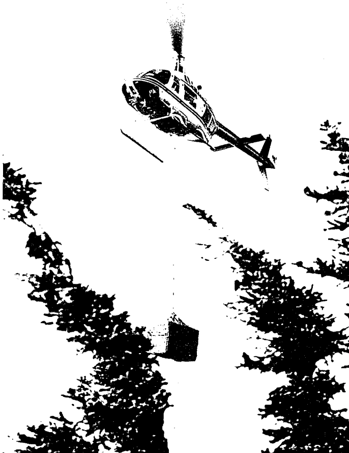
FIGURE 8. Method used to transport introduced mountain goats from Olympic National Park. This illustrates the expense of live capture and removal programs.

The newly emergent concept of animal rights has been central to many recent debates involving animals, whether they are found on farms, in laboratories, or in the wild. Attempts to control destructive exotic mammals, such as the Grand Canyon burros, have been opposed by animal welfare and animal rights organizations whose members perceive the harassment or death of sentient beings to be unjustified or cruel and immoral. (But see also the discussion on domestic animals, below.) However, the introduced-species issue is not as straightforward as those that involve obvious cruelty to animals. While the humane treatment of sen-