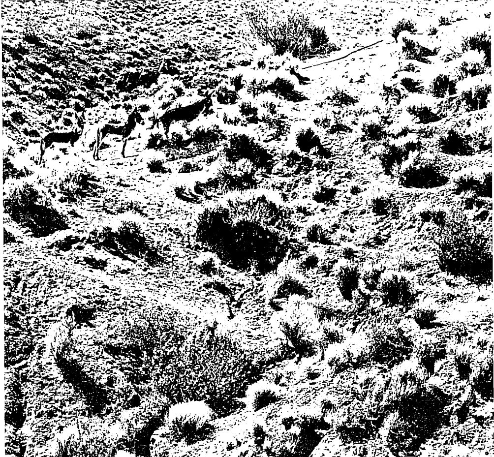
FIGURE 7. Burros brought to North America by the Spanish in the sixteenth century. Thousands now roam the deserts of the Southwest.