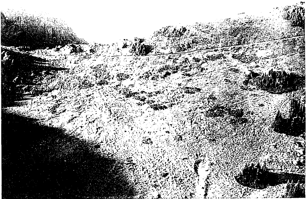
FIGURE 1 Aerial photography showing trails, dust-bathing sites, and erosion caused by introduced mountain goats in fragile alpine vegetation — Olympic National Park.

Perhaps the most pervasive ecological disruption caused by introduced mammals is the destruction of soils—the basis of much, if not all, of terrestrial life (Fig. 1 and 2). A dramatic example of soil damage caused by an exotic mammal is the transformation that took place on the island of St. Helena following the introduction of domestic goats. In 1501, this subtropical island in the Atlantic Ocean was densely covered with forest vegetation, but in 1513 goats were imported by the Portugese. With an abundant food supply, and no predators or competitors to limit their population,