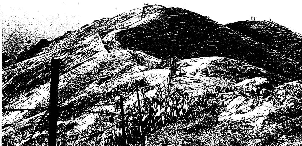
FIGURE 5. Fence erected on Santa Catalina Island. The right side is goat-free. Note the differences in vegetative cover.

iguanas with no place to hide in time of danger. As a result, they were captured more frequently by the hawks, and were soon threatened with extinction (Dowling, 1964). Non-native herbivores also compete directly for food and other resources with native animals. For example, seed-eating birds became extinct on Guadalupe Island in Mexico following the importation of domestic livestock, which consumed many of the same plants (Greenway, 1958). In addition, it has been suggested that introduced ungulates, such as the burro and Barbary sheep, have contributed to the decline of the native bighorn sheep ( Ovis canadensis ) in the southwestern United States (Hansen, 1980). One study found that the diets of burros and bighorns overlap by as much as 52 percent (Walters and Hansen, 1978), and it follows that any vegetation eaten by feral burros would not be available for the bighorns (Fig. 7).