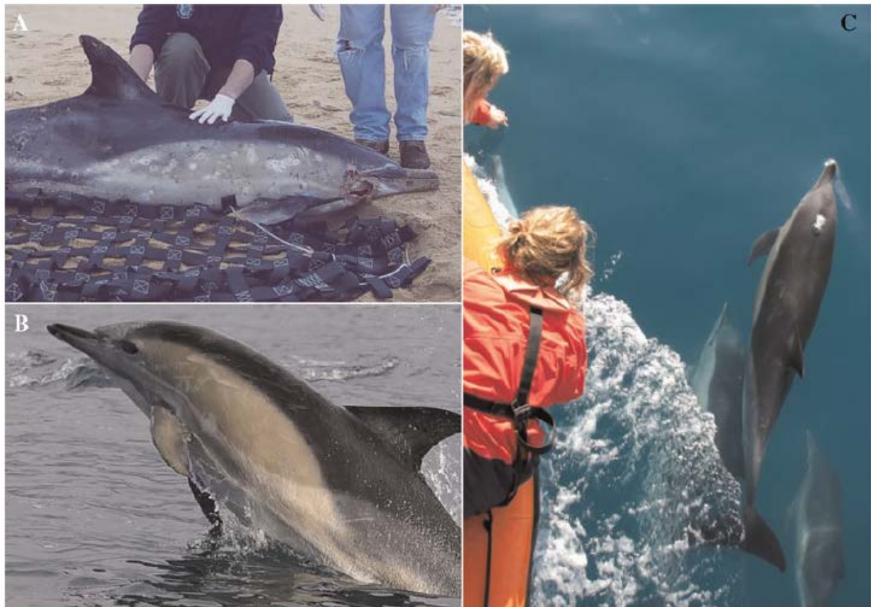
Fig. 2. Photographs of D. delphis recorded by the research teams: (A) shows a 2.19 m deceased adult male recovered by the CRRU veterinary team from Rattray Head, south of Fraserburgh, in May 2005; (B) and (C) show common dolphins sighted during two separate boat encounters in the outer Moray Firth study area. The largest school encountered during the investigation was with an estimated 450+ animals on 22 June 2009 (photographs: Kevin Robinson and Pascal Kriwy/CRRU).