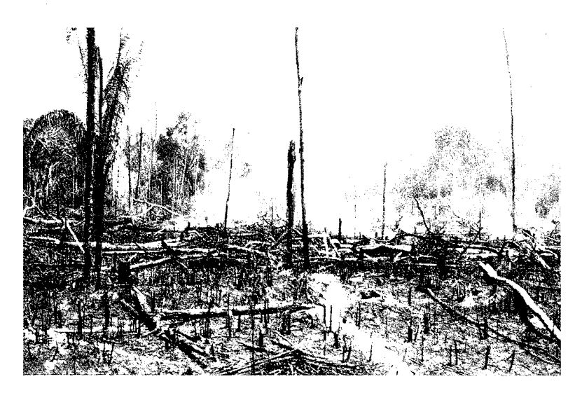
Figure 1. Slash-and-burn agriculture, practiced throughout the humid tropics, is feasible if limited to small areas. (Rondonia, Brazil;)

which are supported with financial and technical assistance from the developed countries, international lending institutions, and transnational corporations.