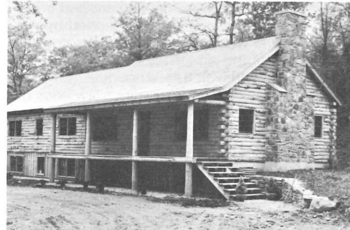
The Norma Terris Humane Education and Nature Center, current headquarters of NAAHE.

As a natural outgrowth of these seminars, workshops, and college courses came the idea for a historic Humane Education Curriculum Development Conference which was held June, 1979. The working conference of twenty-three participants from different parts of the country developed a model humane