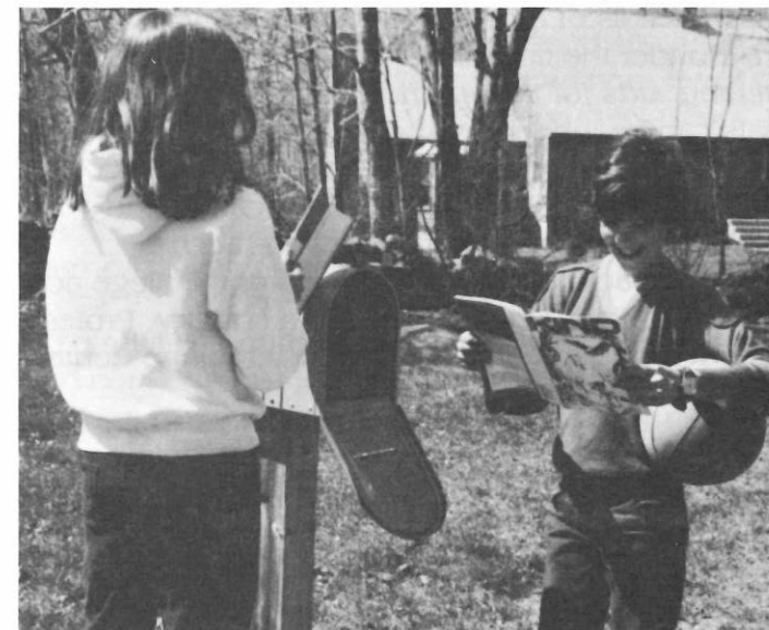
Today, young people all across the country read and enjoy Kind magazine.

But tragedy struck on December 1, 1963 when Fred Myers, just fifty-nine years old, died of a heart attack. The loss to the humane movement and, especially, The HSUS was keenly felt by those who had known and worked with him. Oliver Evans, who had guided the Society for eight months with Myers' help, now assumed full responsibility for the growing organization. Evans continued with plans for the National Humane Education Center. When the shelter was completed, a program of training seminars for shelter managers and other personnel was begun. A classroom in the main building was used to train visiting students while part of the remaining space served for the creation and development of the KIND Youth Membership Program. It was soon discovered that travel distances from other parts of the country to the Virginia facility was a major deterrent to attendance. Also, operation of the demonstration shelter was siphoning funds from national humane programs.