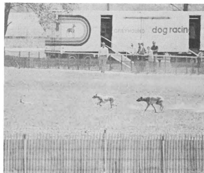
Using telephoto techniques, HSUS investigators filmed cruel coursing events using live rabbits.

The Society also has gathered detailed information on coursing and training greyhounds for racing purposes. In 1978, HSUS investigators, sizing up the coursing field of the National Greyhound Association, determined that television filming could be done from an adjacent field owned by another party. Accordingly, a team of ABC photographers and crewmen filmed the event and showed the coursing on the "20/20" TV news program. The result was an immediate surge of public indignation. Bills have been introduced in Congress but hearings have not yet been held. Meanwhile, primarily due to the publicity, the National Greyhound Association has itself banned "public" coursing.