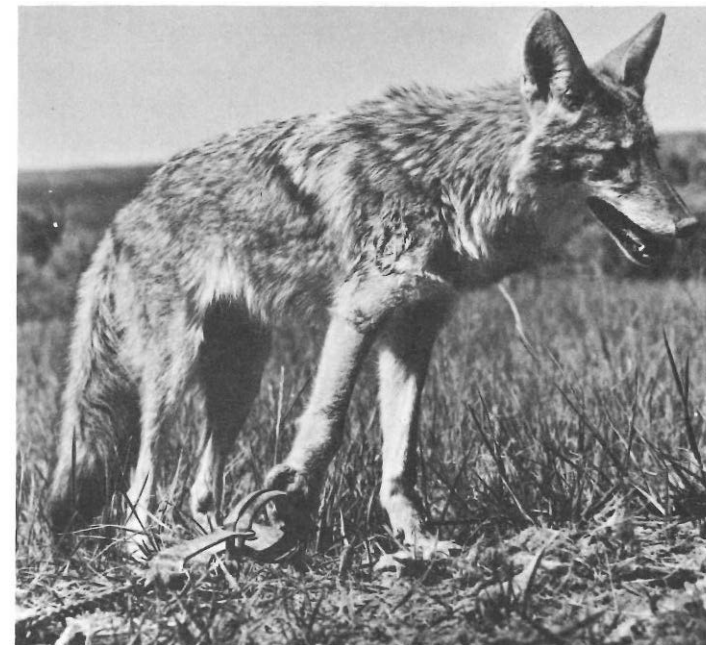
Anti-trapping continues to be a major thrust of HSUS programming.

Senator Richard L. Neuberger of Oregon, a HSUS Director, introduced the first humane trapping bill in July 1958 at our request. The bill was cosponsored by Senators Estes Kefauver and Hubert H. Humphrey and would have required the painless capture or instant kill of animals trapped on federal lands and federal waters. It would also have required the inspection of traps every 24 hours. Unfortunately, despite all efforts, the bill did not become law.