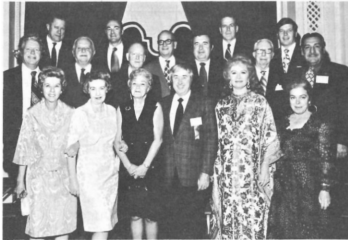
— The Photomaker