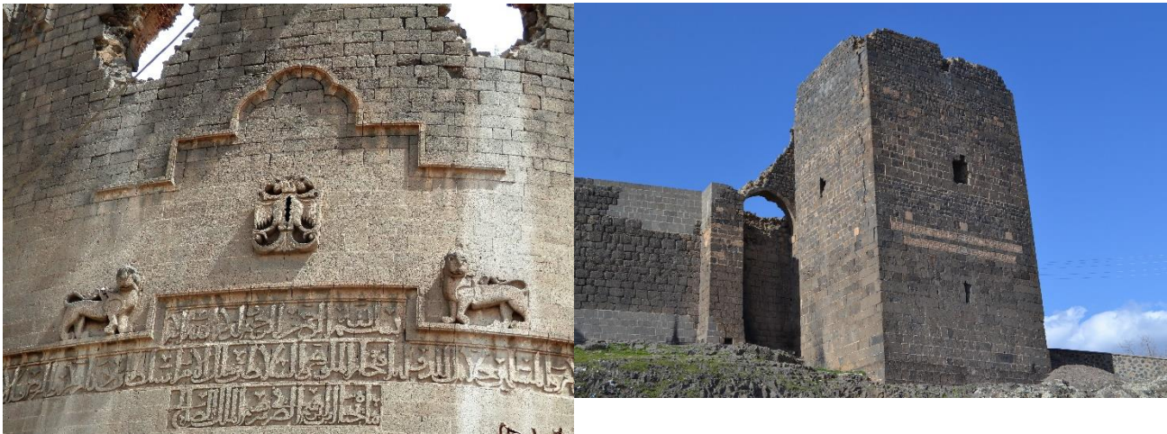
Figure 2. Basalt applications on Diyarbakır City Walls

This study aims to understand how the cyclic loads impact the basalt with which the DCW were constructed. To accomplish this, fresh (massive and vesicular) basalts samples were collected from different sections of the study area. In order to determine their durability, environmental conditions were artificially simulated in accelerated weathering tests.