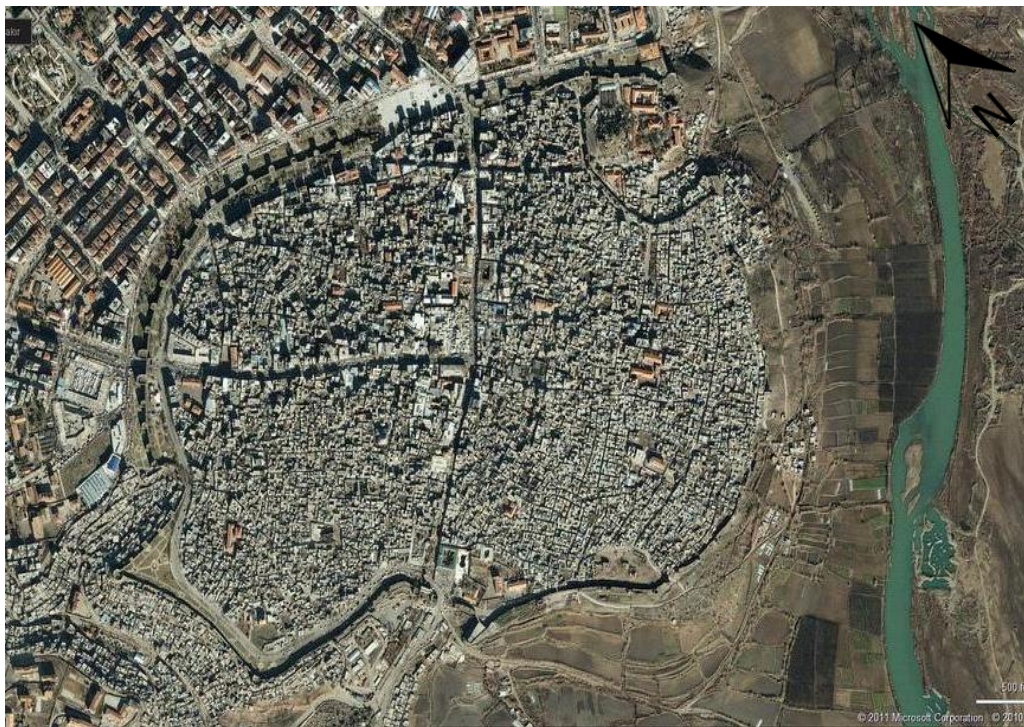
Figure 1. Aerial view of the DCW (captured from Google Earth)

The Diyarbakır City Walls (DCW), is a World Heritage Site located in the southeast of Turkey. The City Walls are among the most gigantic and surviving structures from ancient times. The history of the DCW stretches back more than four thousand years, therefore making the extant City Walls a combination and reflection of influences of the various civilizations that settled in the region [6]. The reflections of these civilizations can be identified in the City Walls' architectural elements, construction techniques and material applications (Figure 1).