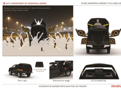
Fig. 4. Preliminary Jury submission by AIOS Team 7.