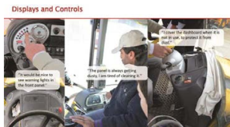
Fig. 1. From the research presentation of Hidromek Team 2.

For the Hidromek operator's workstation project, teams made visits to construction sites on several occasions (Figure 1). Additionally, the firm arranged a visit for student teams to their operation field where they were able to try out the workstation and controls for themselves. The firm also provided the Department with a cabin to be temporarily placed in a hangar in the University for teams to work on their 1:1 scale mock-ups.