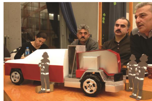
Fig. 5. Karba representatives at the Preliminary Jury.

For this project, it took longer than expected for the teams to determine the vehicle type suitable to their design concept, as the technical issues in vehicle selection and adapting the concept onto the vehicle proved to be difficult. In the preliminary jury it was seen that three out of seven teams had determined wrong vehicle types, due to misjudgments and technical miscalculations. The vehicle selection either was insufficient in terms of required apparatus performance, or did not fit the usage scenario. The technical feedback provided in the preliminary jury was helpful in guiding the teams, and it took another week for the teams to revise their concepts and finalize their vehicle selection accordingly.