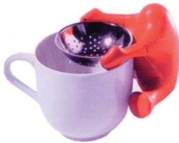
Figure 2. ‘Te ò’ by Alessi.

The outlook of several firms presented a more explicit emotional intent. The design activities of one of the world’s famous product design companies, Frog design, took the motto ‘form follows emotion’ as a basis of their designs. The founder of the company, Hartmut Esslinger, stated “... even if a design is elegant and functional, it will not have a place in our lives unless it can appeal at a deeper level, to our emotions” (Esslinger in Sweet, 1999, 9). In case of Alessi, an Italian product design firm, the aim of evoking positive emotional experiences was clearer. The firm’s main goal was to design to evoke happiness, laughter, humor and enjoyment (Gabra-Liddell, 1994). A tea strainer, ‘Te ò’ ( Figure 2 ), which represents a ‘cheerful’ character with a humorous storyline of interaction, typifies the general outlook of the firm to the design and illustrates their way of designing for emotional experiences.