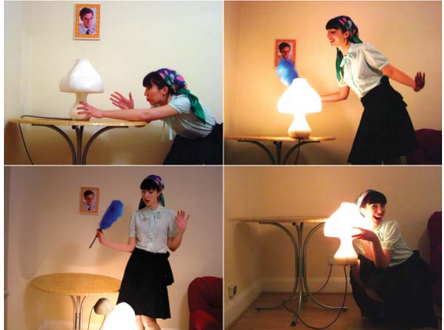
Figure 4. Interaction storyline of an on-edge lamp.

for accidents, increasing user tension and evoking expectations about a prospective breakage. However, the lamp's elastic body resists the impact of the fall and delivers a happy ending.