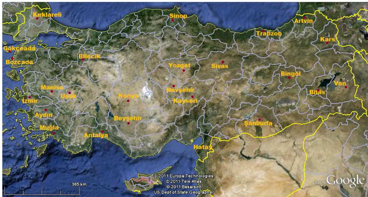
Figure 1. Locations of the populations studied.