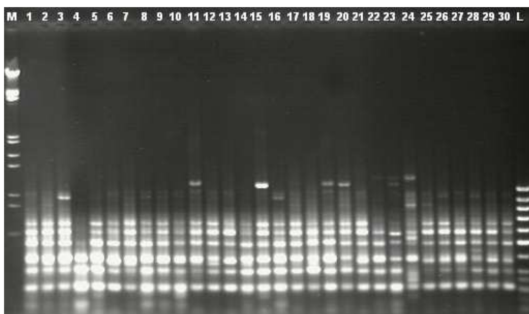
Figure 2. Banding pattern obtained by OPB-2 primer in Kirklareli honey bee population (M: Lambda DNA/EcoRI+HindIII; L: 100 bp DNA Ladder).

The percentage of polymorphic loci ranged between 37.14 and 64.76%. The highest and lowest percentages were calculated in Antalya and Hatay populations, respectively. The proportion of polymorphic bands, expected heterozygosity ( H_e ), Shannon's information index ( I ) values, and their standard errors are given in Table 2. The expected heterozygosity levels for honey bee populations ranged between 0.035 (Şanlıurfa) and 0.175 (Antalya). Gene diversity and Shannon's index values for all populations were estimated to be 0.187 and 0.305, respectively, the latter ranged from 0.073 (Şanlıurfa) to 0.271 (Antalya). The highest number of bands was observed in Bozcaada and Antalya populations as 72 and 70, whereas the lowest number (39 bands) obtained in Hatay population (Table 2). Aydın, Gökçeada, Muğla, and Şanlıurfa each have one different private band; 3000 (OPB-5), 2027 (OPB-7), 3530 (OPB-1) and 1632 bp (OPB-2), respectively.