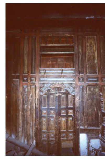
Figure 13. A detail from the east wall of Gavremoğlu's sofa.

Figure 12. A detail from the south wall of Gavremoğlu's sofa.