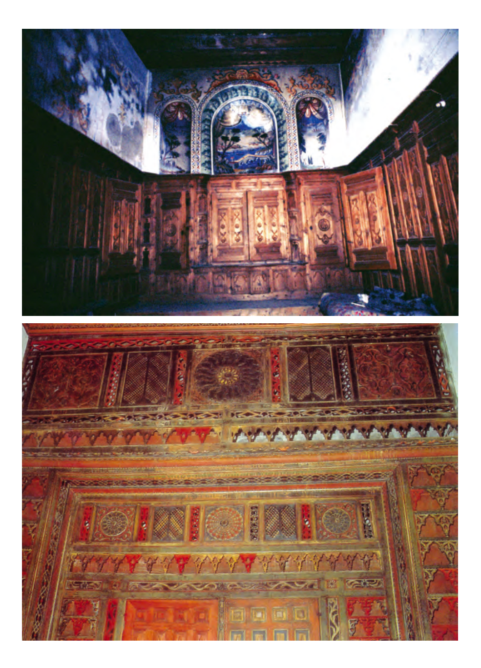
Figure 9. Northeast wall of Öztaşçı's sofa, construction date: 1877.