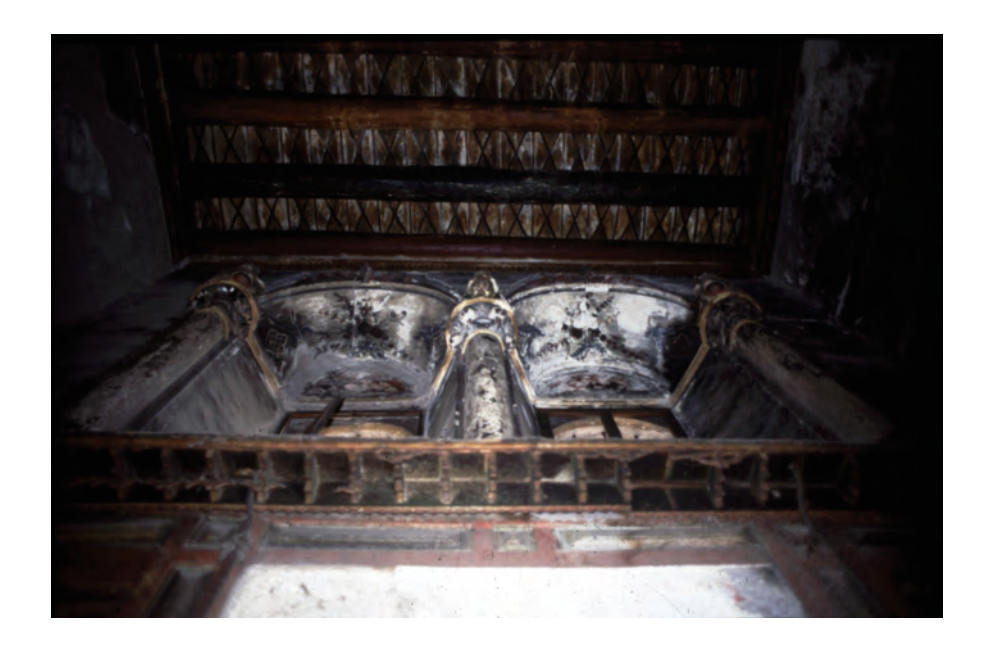
Figure 3. Interior elevation of the entrance wall of Gavremoğlu House.

in Kayseri today. Although every flat or house has a salon , the majority of families do not use it regularly. Instead they use a smaller family living room, named as "sitting room" for daily living and reserve the salon for guests and important occasions like religious holidays, weddings or similar ceremonies, social gatherings and funeral meetings (İmamoğlu, 1988). In traditional houses too, the sofa was the public face of the house and seems to continue this function today by changing its name and character in adapting to contemporary living. The family in old days, as today, spent their daily life in a less extravagant harem room, more or less similar to the sitting room of our time. While harem room and other rooms were equipped with a gusülhane (built-in bath cubicle) due to its formal character, sofas lacked this provision.