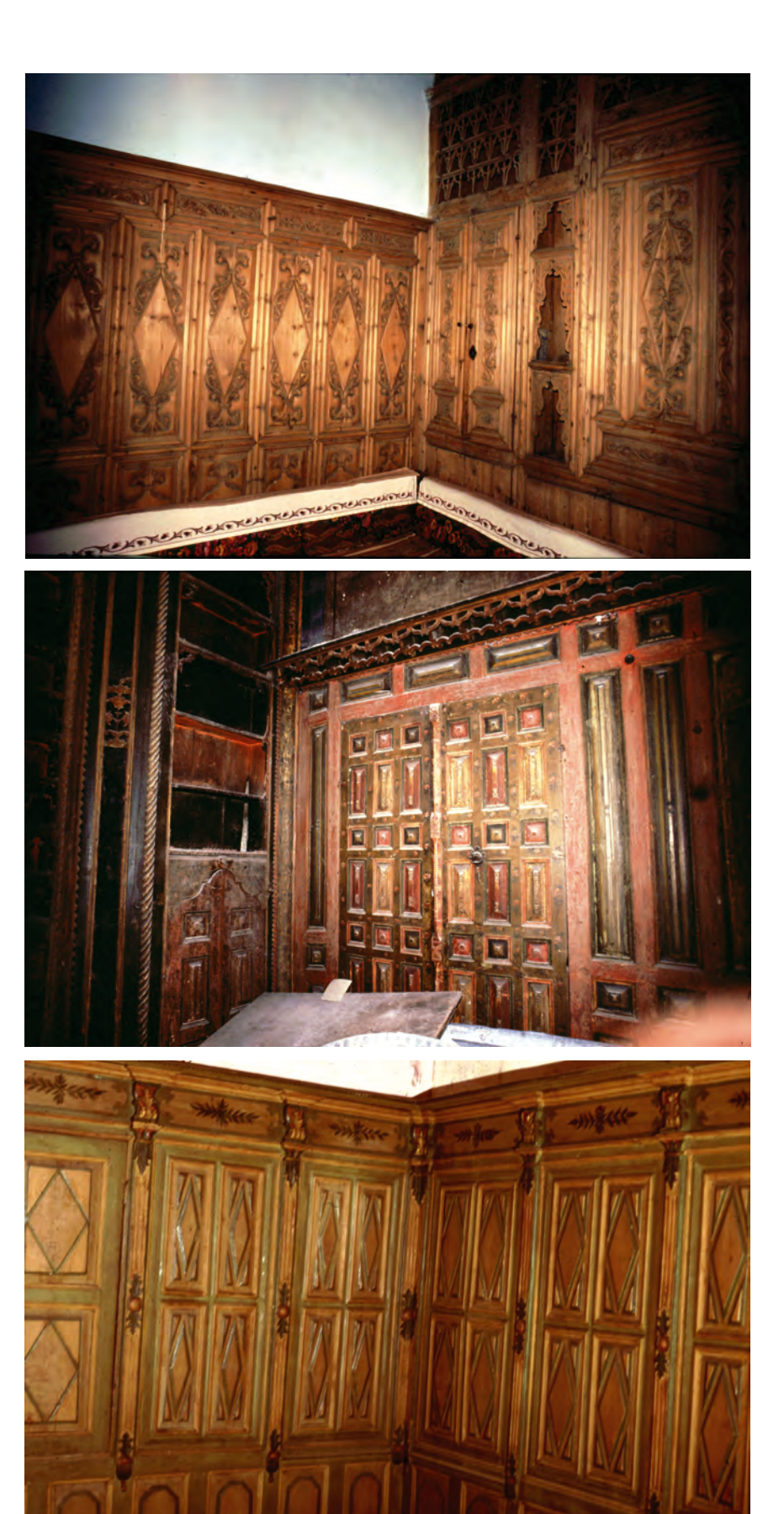
Figure 4. A view from the sofa of a house in Çifteönü quarter, a 19th century building.

Figure 5. West wall of Gavremoğlu's sofa.