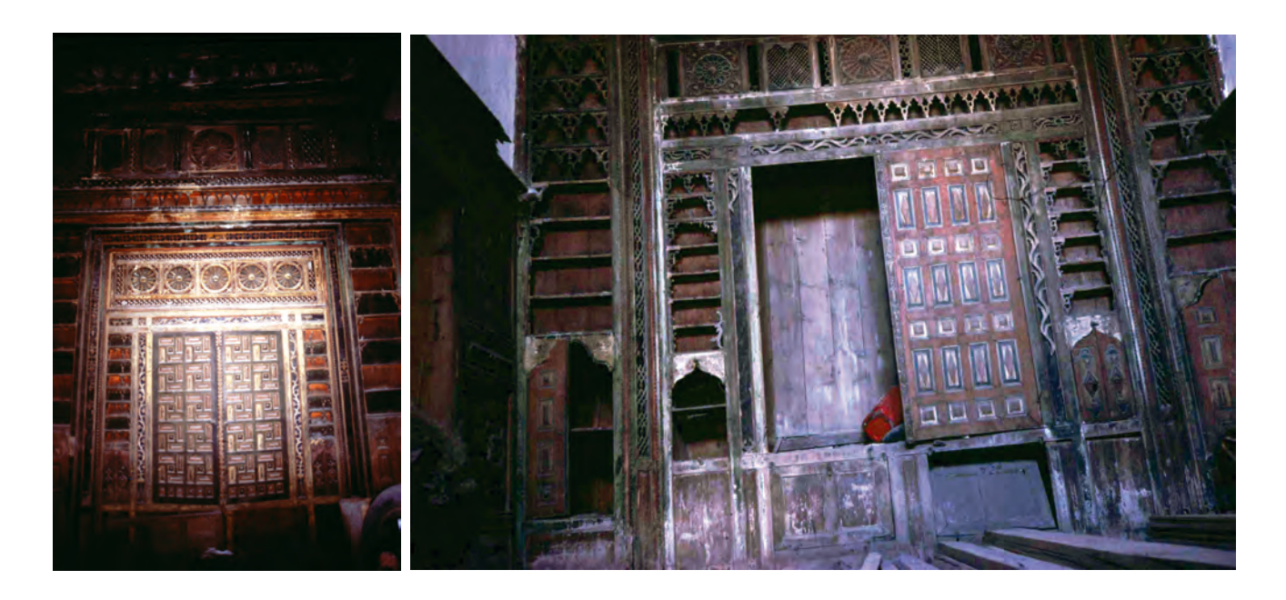
Figure 7. South wall of Gavremoğlu 's sofa.Figure 8. South wall of Güpgüpoğulları 's sofa.

quality floral painting enriched by the addition of birds and fabulous creatures (Gladiss, 2000). Walls in all these examples carry many common features of a zar of a Kayseri sofa: a careful design approach to wall panels; utmost care for proportions of panels, doors and alcoves; molding or painting the wood surfaces with abstract or realistic floral figures; integrating lower part of the panels with the upper cornice or continuous top shelf; and utilizing bold colour schemas of reds, yellows, greens in a harmonious blend.