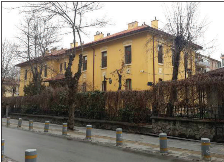
Figure 25. Lodgings of the Agriculture Bank ( Ziraat Bankası ). The Apartment is known as the Altılı Tip (Six-Unit Type). Architect: Giulio Mongeri. Date: 1925-26.

came to the new capital city (Table I). As Ankara became the capital city, the immigration of Anatolian villagers there significantly increased. These villagers were poor after years of war, and they were looking for working opportunities in the new capital city. In the face of the limited accommodation means in the new capital city, investments for sheltering the newcomer workers and their families provided to be insufficient. Unable to afford renting old houses or constructing new ones, illegal constructions would become a self-help method as the immigrants in Ankara tried to solve their sheltering problems in the surroundings of the old city towards the north (later known as Altındağ) and the northwest (Akköprü swamps, plantation fields), which were considered unsuitable for planned constructions, thus empty and unsupervised as excluded from the ongoing plans, providing available grounds for the development of unplanned housing (Şenyapılı, 2004, pp.74-75). Temporary dwellings, which were set on treasury property or the property of others, thus started to appear, and soon defined as shed-houses ( barakas as they were called) 15 (Cengizkan, 2009, p. 46).