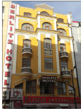
Figure 3B. An apartment (Hükümet Street, No: 4). Date: 1920s.