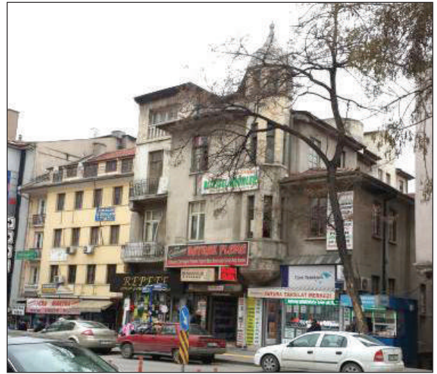
Figure 11B. An apartment (Anafartalar Street, No: 60). Date: before 1928. 2018.