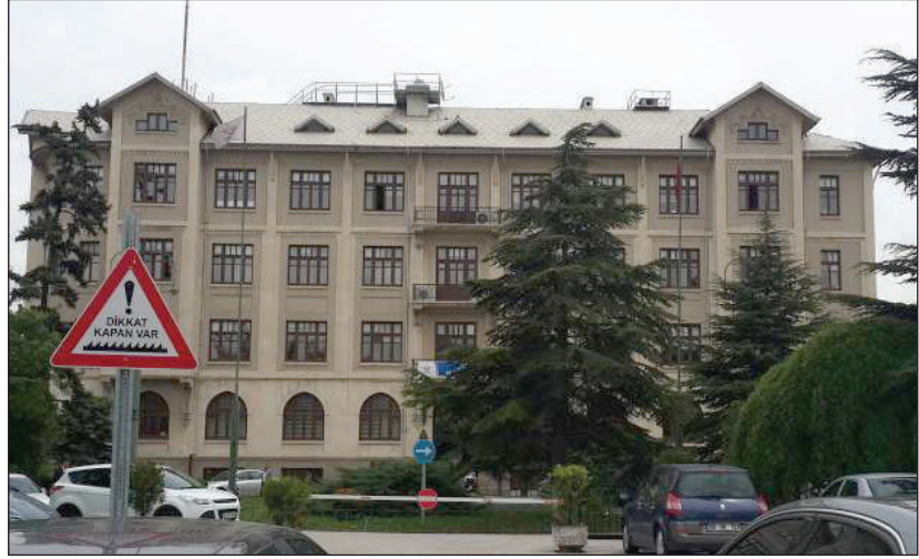
Figure 16B. Building and Lodgings of State Railways Administration. Architect: A. Kemalettin Bey. Date: 1925-1928.