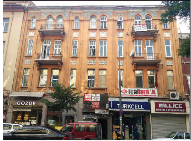
Figure 9B. Sakarya Apartment (Anafartalar Street). Initiated by Nuri Conker. Date: 1923.