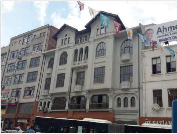
Figure 5. Büyük Apartment (later known as Koç Apartment) (Hisar Street). Date: 1920s.