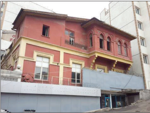
Figure 3A. A house (Çankırı and Armutlu Streets, Karaoğlan Quarter). Date: 1920s.