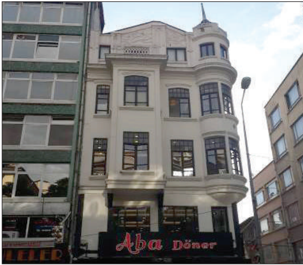
Figure 11A. An apartment (Anafartalar Street, No: 42). Date: before 1928.

The southeast part of the city, including the Samanpazarı, Hamamönü, and Gündoğdu (also known as the Dumlupınar) quarters, was also affected by the transfor-