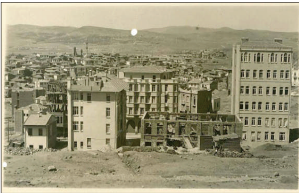
Figure 6A. The Hisarönü Quarter, 1930. 13 In the middle and at the right: Apartments (Işıklar Street, No: 27 and 22). Source: VEKAM Library and Archive, Inventory no: 1284.