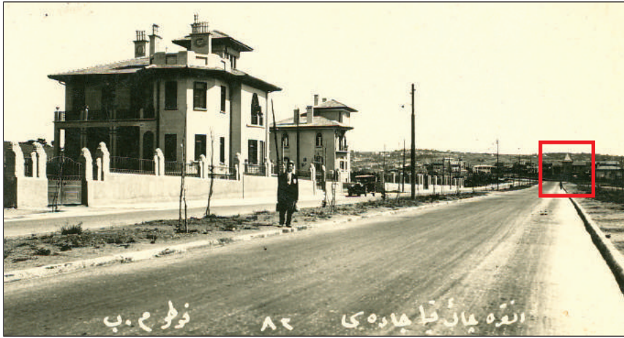
Figure 20A. Fevzi Paşa Mansion (Yenişehir). Architect: Arif Hikmet Koyunoğlu. Date: before 1928. Source: VEKAM Library and Archive, Inventory no: 2480.