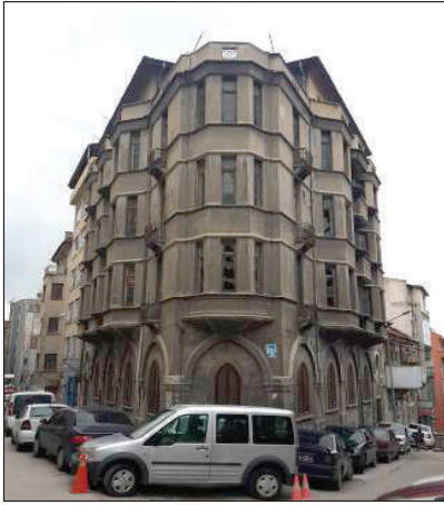
Figure 7A. Erzurumlu Nafiz Bey Apartment (Işıklar Street, No: 27). Date: 1922.

were built during the 1920s (Figure 10A and 10B) by private initiatives on available empty lots within the already crowded Anafartalar Street of the old city, and almost all were thus small and narrow, adjacent to or semi-detached from neighboring buildings. They were at most three to five storeys high with ground floors used as shops, such as the towered-apartments of the Yeğenbey (Anafartalar) Street (Figure 11A and 11B). On this street,