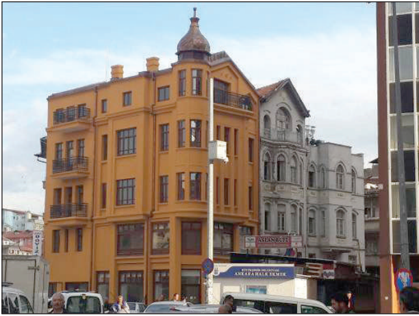
Figure 2A. Erzurum Hotel (Alsancak Street, No: 15), Avrupa Hotel (Susam Street, No: 8) and its addition (Susam and Tahtakale Streets). View from Hal Square. Date: 1916/1917-1920s.

Despite the construction of new houses and apartments that began to transform the traditional neighborhoods in the old city, these proved to be insufficient to meet the housing requirements of the growing population.