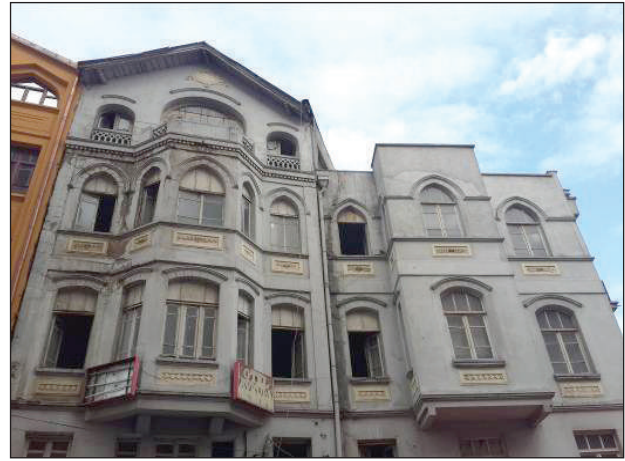
Figure 2B. Avrupa Hotel and its addition. Date: 1916/1917-1920s.