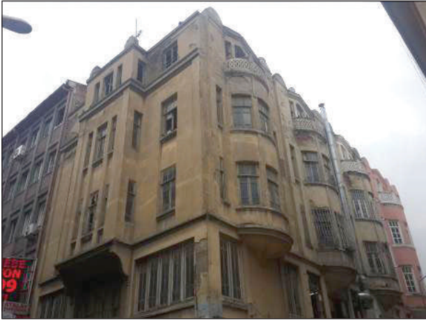
Figure 9A. An apartment (Mevsim Street, No: 6, 8, 8a). Date: 1924.

institution's tenement apartment was built as one of the apartment complexes that are authentic to Ulus (Figure 12A). These are large apartments that housed many flats, constituted different facilities and formed small communities within themselves. One of the other well known apartments of the period, the Hasan Fehmi Ataç Apartment (later known as the Büyük Hotel) initiated