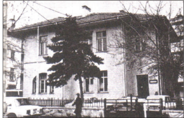
Figure 22B. A House (Milli Müdafaa Street, No: 4). Date: 1920s.