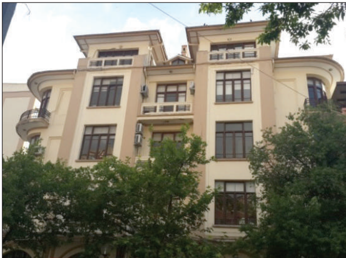
Figure 12A. Children's Protection Agency and its rental apartment (Çocuk Sarayı (Anafartalar) Street). Architect: Arif Hikmet Koyunoğlu. Date: 1926. Photograph by: D. Avcı Hosanlı, 2018.