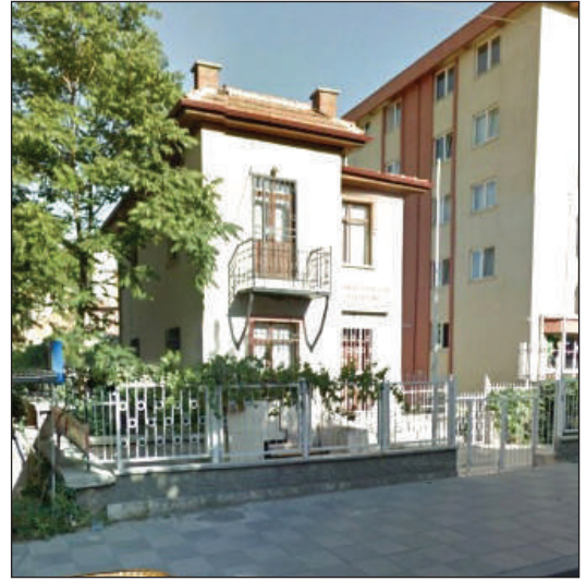
Figure 14B. One of the Hamamönü Foundation houses that still stands today (Dumlupınar Street, No: 13).