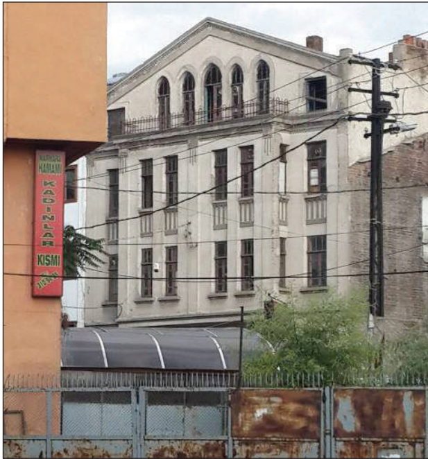
Figure 13A. An apartment (Acıçeşme Street). Date: 1920s.

As the area of the city was expanding with construction along the central axis starting from the Taşhan Square and leading towards the south, along with the new public buildings and places, new houses and apartments began to take place also in this part of Ankara that included the İstiklal and Youth Park quarters and the new blocks towards the Train Station (Table I, Figure 1A and 1B). Among the public buildings lined along Banks Street (later part of Atatürk Boulevard), only the Directory of State Monopoly (Tekel) included a residential function with its lodgings designed together with the offices in the building (Figure 16A). The real spread of the old city was witnessed by the constructions towards the Train Station.