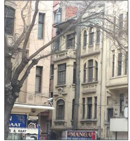
Figure 7C. Hatay Apartment (Hasan Pehlivanlı İşhanı) (Hekimler Street, No: 4). Date: before 1927.