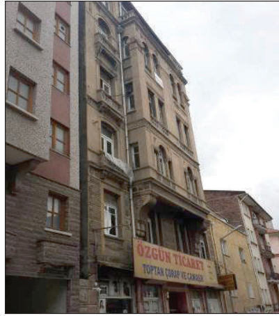
Figure 7B. An apartment (Işıklar Street, No: 22). Date: before 1927.