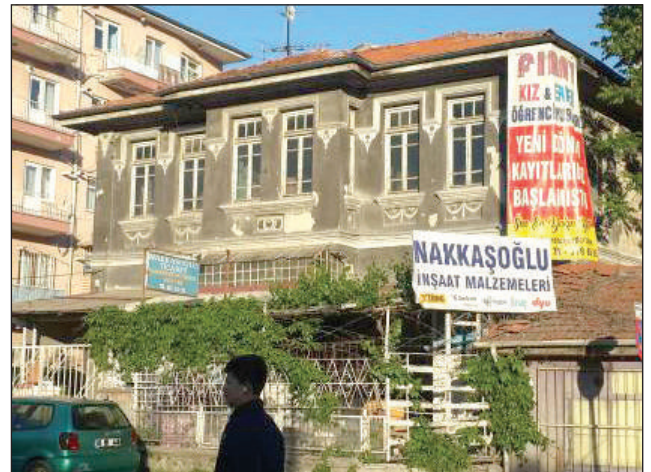
Figure 15B. A house (Dumlupınar Street No: 8. Date: 1920s.