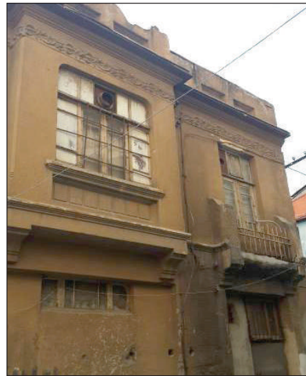
Figure 8B. A single house (Kocalar Street, No: 1, Hisarönü Quarter). Date: 1920s.