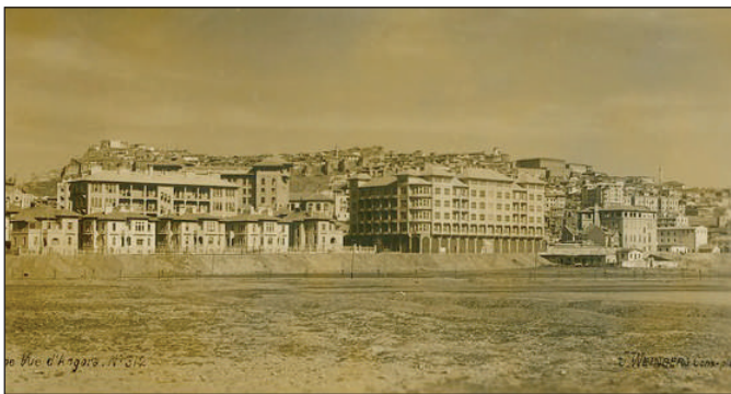
Figure 17A. Foundation Houses, 1928. Architects: A. Kemalettin Bey and Arif Hikmet Koyunoğlu, Date: 1923-1924. First Foundation Apartment ( Belvü Palas), Architect: A. Kemalettin Bey, Date: 1926-1930. Second Foundation Apartment, Architect: A. Kemalettin Bey, Date: 1926-1928/1930.