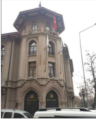
Figure 16A. Building and Lodgings of Directory of State Monopoly (Tekel). Architect: Giulio Mongeri. Date: 1928.

The housing need after Ankara had been declared as the capital city affected the transformation of not only the old city but also the traditional vineyards in its peripheries (Table I). The vineyard houses had been used for centuries, and as Vehbi Koç describes: