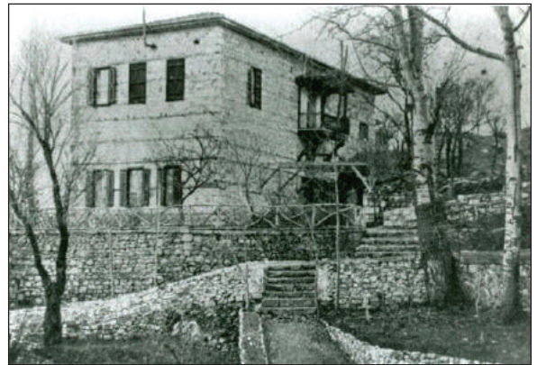
Figure 18B. A Vineyard house (later President's Mansion) (Çankaya). Source: VEKAM Library and Archive, Inventory no: 0216.