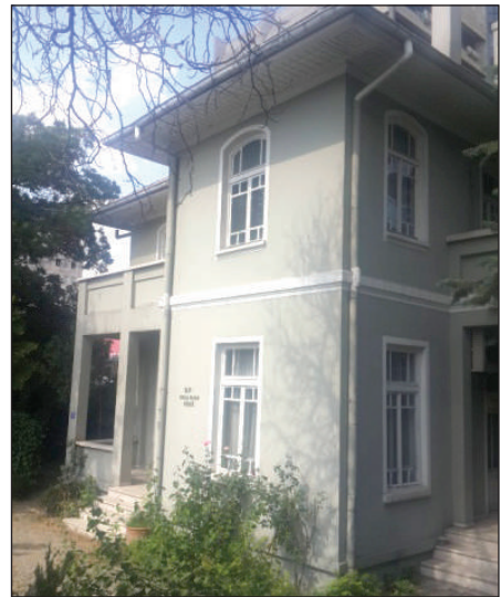
Figure 26. Celal Bayar Mansion (Yenişehir). Architect: Arif Hikmet Koyunoğlu. Date: 1920s.