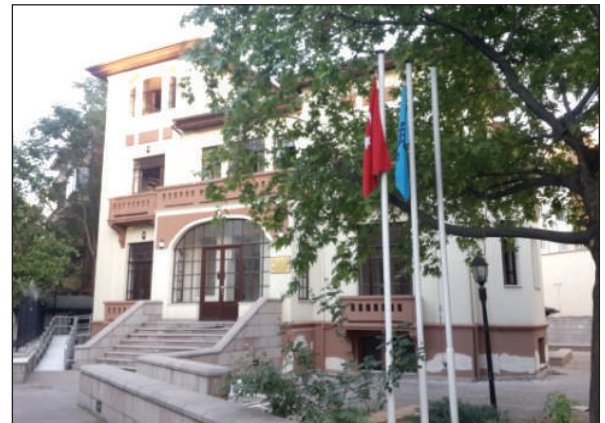
Figure 24B. Necati Uğural or Sait Bektimur House (Mithatpaşa (İsmetpaşa) Street). Date: before 1927.