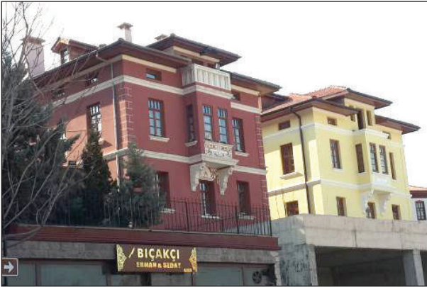
Figure 4B. Twin Hungarian houses (Gaziantep (Çamlıca) Street, Hacıbayram Quarter). Date: 1920s.