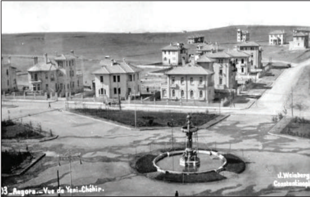
Figure 22A. Houses (Milli Müdafaa Street and Necatibey Street). First row, the second one from the right is the House on the Milli Müdafaa Street at No: 4. Date: 1920s. Inventory no:0038.