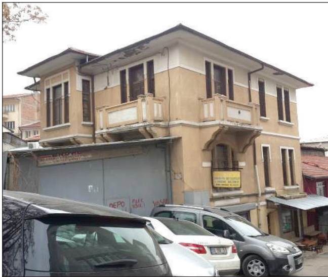
Figure 8A. A single houses (Konya-Kahraman Street, Hisarönü Quarter). Date: 1920s.