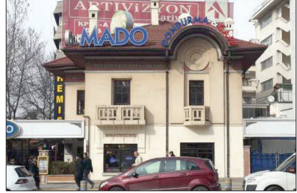
Figure 21B. A House (Ziya Gökalp Street, No: 13). Date: 1924-25.