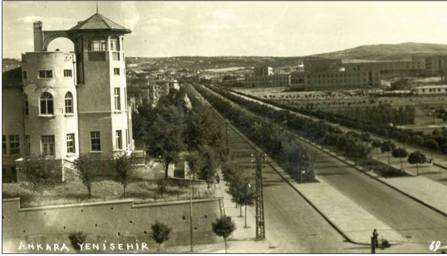
Figure 19. Gazi Mustafa Kemal (Atatürk) Boulevard and Cemil Uybadin Mansion (later Italian Embassy) (Yenişehir). Date: 1924-1925.