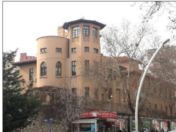
Figure 23A,B. Two Villa-Type Houses (Necatibey Street). Date: 1920s.