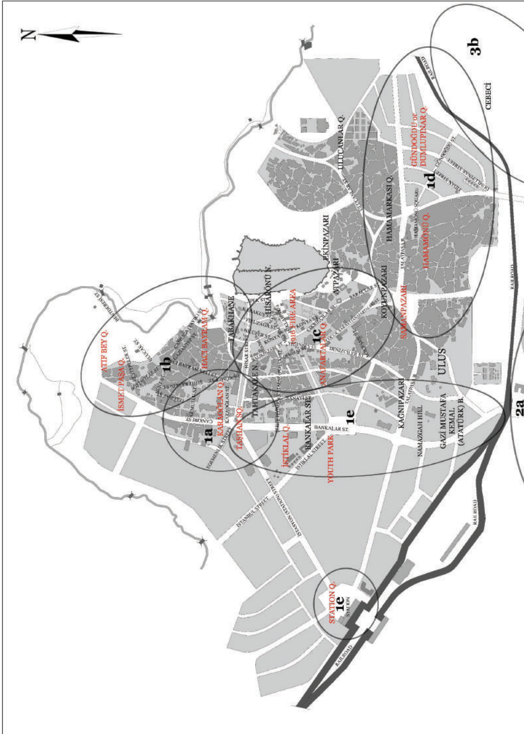
Figure 1A. Settlement Zones in Ankara during the 1920s I: The old city-Ulus.