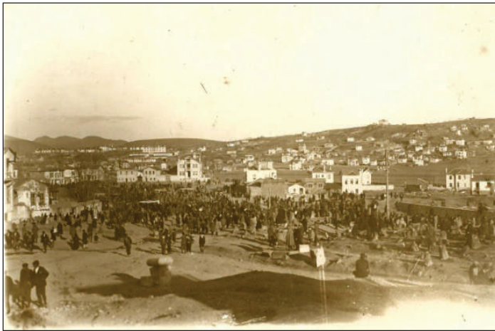
Figure 27A. Planned and Un-Planned Housing Development (Cebeci). Source: VEKAM Library and Archive, Inventory no:1992.

At the end of the 1920s, despite all the efforts to stop unplanned production of residential architecture, Cebeci had already developed with one-storey shed-houses together with only a few planned ones. The Development Management Committee ( İmar İdare Heyeti ), with the regulation dated June 11, 1929, and numbered 1504, initiated a demolition process of shed-houses (Şenol-Cantek and Zırh, 2014, p.150). However, this type of