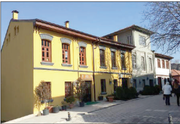
Figure 4C. Three Hungarian houses (Yayık (Gülbaba) Street, Hacıbayram Quarter). Date: 1920s.

Eventually, the empty areas in and around the historic city were expropriated for new constructions, creating new areas within the traditional context in the Anafartalar, Samanpazarı, Hamamönü, Gündoğdu, İstiklal and the Youth Park quarters (Table I; Figure 1A and 1B). This created a faster transformation of the old city in the areas in the south and west of the citadel towards the Train Station.