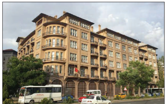
Figure 17B. Second Foundation Apartment (İstiklal Street). Architect: A. Kemalettin Bey. Date: 1926-1928/1930.