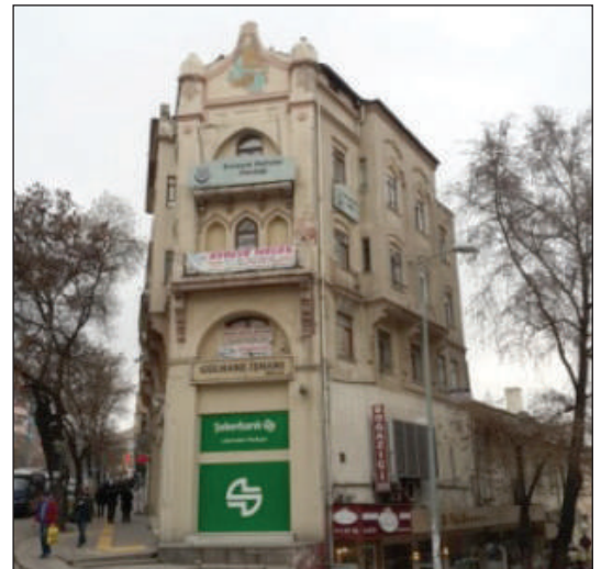
Figure 12B. Hasan Fehmi Ataç apartment (Çocuk Sarayı (Anafartalar) Street). Date: 1925.