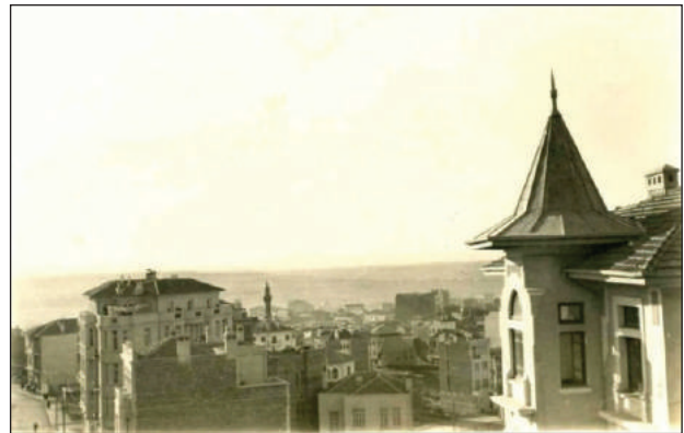
Figure 6B. Houses and Apartments (Hisarönü Quarter). Işıklar Street, 1925 (Left back: Erzurumlu Nafiz Bey Apartment). Inventory no: 2140.