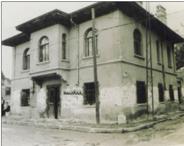
Figure 15A. A house (Gündoğdu Street, No: 1), Date: 1920s. Source: VEKAM Library and Archive, Inventory no: TKV0107.