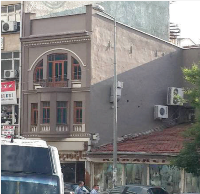
Figure 10A. A single house (Yeğenbey (Anafartalar) Street, No: 36). Date: 1920s.