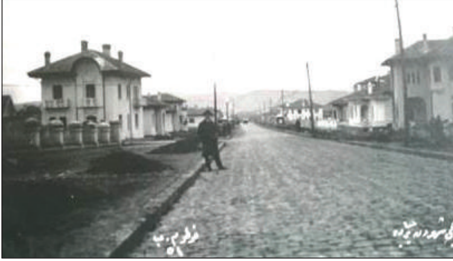
Figure 21A. Houses (Kazım Özalp (Kazım Paşa, Ziya Gökalp) Street). Architects: A. Kemalettin Bey and Arif Hikmet Koyunoğlu. Date: 1924-25.