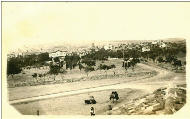
Figure 18A. Vineyard houses (Keçiören).

Çankaya had been one of the vineyard areas before it was connected to Yenışehir and became the most prestigious area of the capital city as one of the vineyard houses here was transformed into the President's House (Figure 18B). As requested by Mustafa Kemal, a vineyard house was searched for around Kavaklıdere and Çankaya, and the Kasapoğlu mansion that had once belonged to an Armenian merchant named Kasapyan was considered as a suitable choice (Yavuz, 2001, p.342). Falih Rifkî Atay argues that the house was owned by an English wool merchant (Atay, 1969, p.352; Yavuz, Y 2001, p.342); and Yavuz suggests that the house might have been used by both merchants in different periods. In 1921, the house was