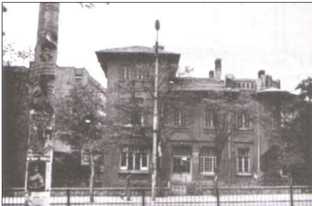
Figure 24A. A House (Necatibey (previously Gazi Mustafa Kemal) Street, No: 9). Date: 1920s. Photograph date: Unknown.

The housing production in Yenışehir mostly consisted of such single detached houses in large gardens. Nonetheless, the examples of apartments were also seen here during the 1920s, generally constructed as housing projects of public institutions to be used as lodgings for their staff. For example, the Lodgings of the Agriculture Bank, designed by Mongeri, were built on Adakale Street. These were consisted of five single houses with three different types, all with basement floors and two storeys above, together with a small apartment constructed as the first of its type in