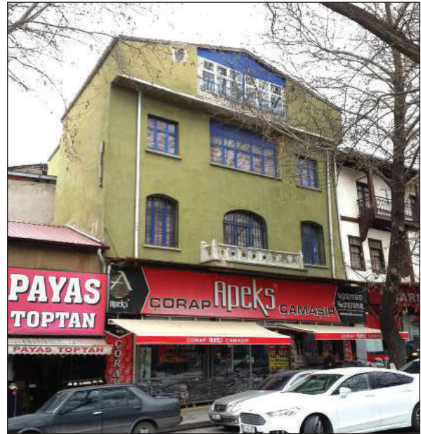
Figure 10B. A single house (Çocuk Sarayı (Anafartalar) Street, No: 89). Date: 1920s.