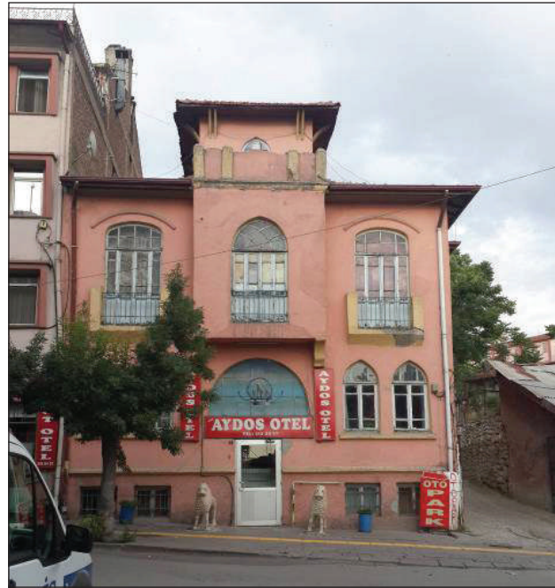
Figure 13B. A house (Denizciler Street, No: 13). Date: 1920s.