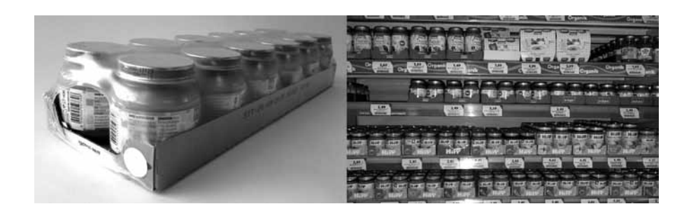
Figure 1. Left: A typical SRP for baby food jars. Right: Shelving of baby food jars in a local supermarket.

Brainstorming is a method for the generation of several ideas within a short time, bringing together a non-hierarchical group of people from diverse backgrounds and with different skills to carry out discussions (Cross, 1995; Pahl and Beitz, 1995; Roozenburg and Eekels, 1995). The group is expected to exercise suspended judgment (Wright, 1998), meaning that criticisms of ideas spoken out are withheld during the discussion before making a decision about them. More focused solutions will be attained if the group members are informed of the problem statement, have background information about the problem area and have a knowledge of currently available solutions (Roozenburg and Eekels, 1995).