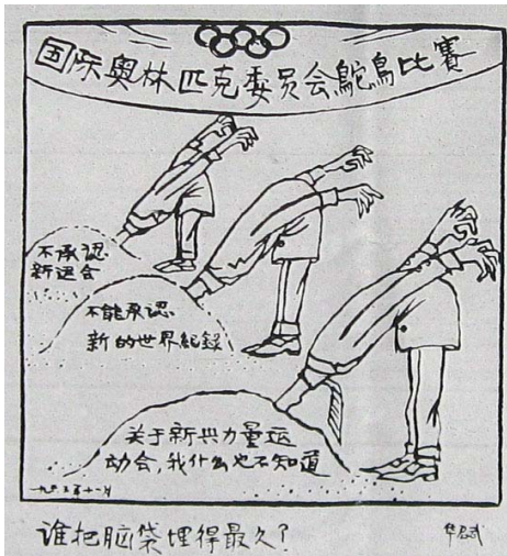
“The International Olympic Committee Ostrich Competition” 92

Another cartoon, printed a week into the Games, was even more brutal. Depicting three men in business suits, each with his head buried in a mound of sand, the banner above declares this the “International Olympic Committee Ostrich Competition.” From left to right, the mounds read: “non-recognition of GANEFO”, “non-recognition of new world records”, and “we don’t know anything about the Games of the New Emerging Forces.” The caption asks: “Who can keep their head buried the longest?”