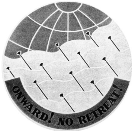
Official logo of the Games of the New Emerging Forces 71

documents, press releases, and reports from the games. The globe represented "Onward!" in the motto and symbolized a march "toward a new world...eternally new" based on "the right conviction and ideals." The flags represented "No Retreat!" and symbolized nations "fighting for truth and justice" by participating in "an international unity to build together a new world, to eliminate imperialism and colonialism in all their manifestations." 70