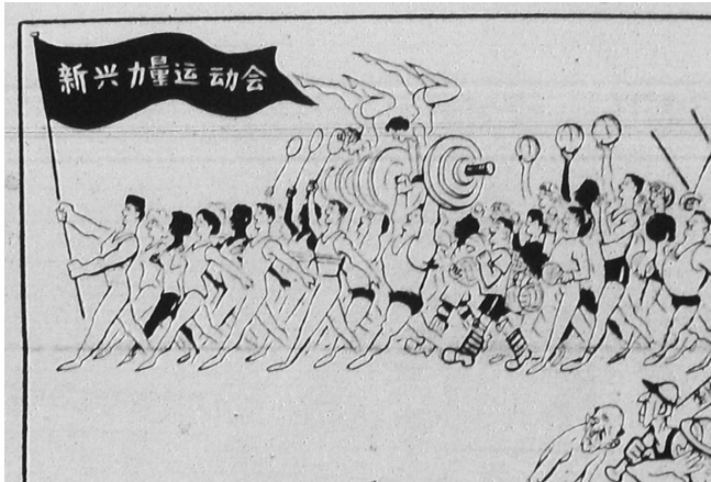
“The Games of the New Emerging Forces” 91

Another cartoon, printed a week into the Games, was even more brutal. Depicting three men in business suits, each with his head buried in a mound of sand, the banner above declares this the “International Olympic Committee Ostrich Competition.” From left to right, the mounds read: “non-recognition of GANEFO”, “non-recognition of new world records”, and “we don’t know anything about the Games of the New Emerging Forces.” The caption asks: “Who can keep their head buried the longest?”