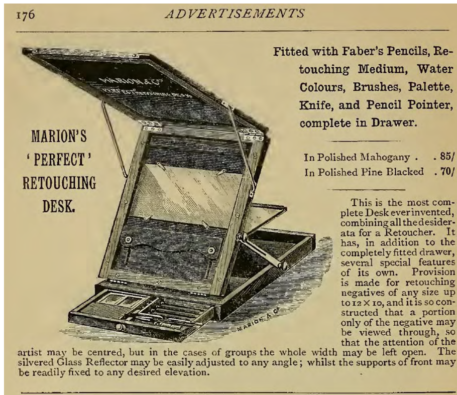
Figure 4 - "Marion's 'Perfect' Retouching Desk". Advertisement for a retouching table, including all the materials necessary, at the back of a book published by Marion & Co (Johnson, 1898:176).

In the USA, worth of reference, Scovill & Adams company sold photographic material in New York and had an editorial headquarters in Washington. They published complete collections dedicated to photography in manual format, divided into practical lessons. One relevant example from 1889 was "The modern practice of retouching negatives, as practiced by french, german, english & American experts" frequently attributed to Paul Piquepé , referred to above, was in fact a compilation by three authors: Piquepé, H. P. Robinson and Johannes Grasshoff , cited above by Vogel. This work is particularly interesting because it provides an analysis of the different views of each author, from France, England and Germany, respectively. The practicality of Piquepé, the pictorialism intentions of Robinson when referring to portrait photography and the emphatic retouching by Grasshoff, in the chapter dedicated to landscape photography.