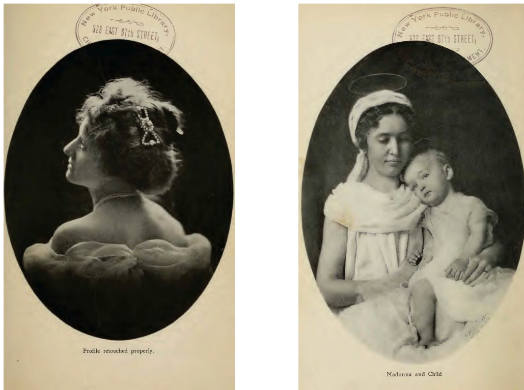
Figure 3 - Left: Print of "Profile retouched properly" and right print of "Madonna and Child" (Weisman, 1903:p.3-11).