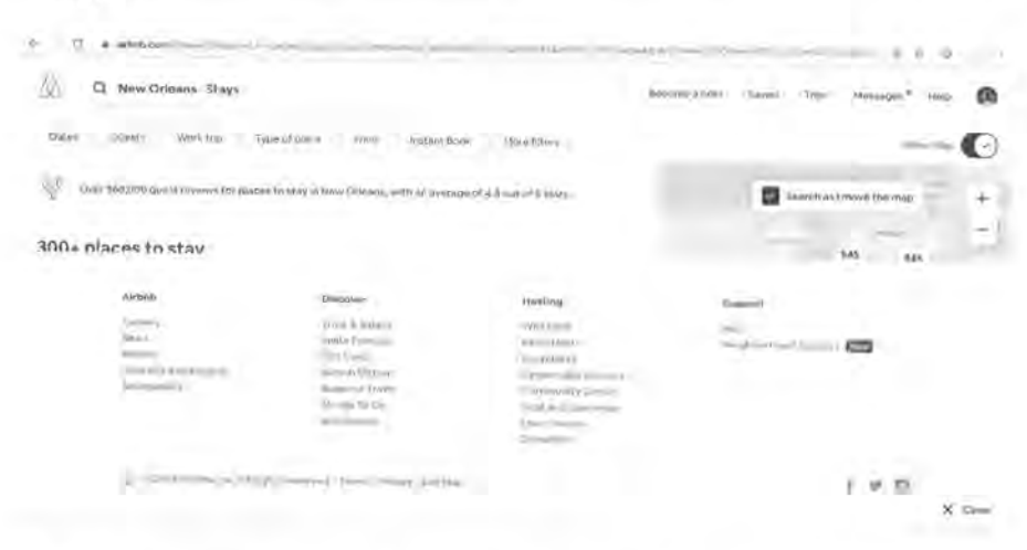
Figure 4. Users Can Scroll to the Bottom of the Page and Select "Diversity & Belonging" from Beneath the "Community" Head ing^{311}

Only after selecting "Diversity & Belonging" can a user obtain information about Airbnb's discrimination policy. 312 If a guest does not proactively seek out information about Airbnb's policy, it is not until they attempt to book a space that the guest is presented with "a message asking them to affirmatively certify that they agree" with Airbnb's commitment to diversity. 313 This is too late. By the time a guest takes steps to book a particular listing, bias has already had an opportunity to influence the decision-making process. For the statement to diminish the effect of bias on the