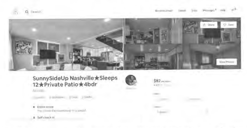
Figure 3. Individual Page for a Listing in Nashville<sup>286</sup>

When a prospective guest clicks on the host's photograph, the prospective guest is directed to the host's profile page, on which hosts can choose what to share with others. This default organization encourages guests to consider a host's demographics when contemplating making a reservation.