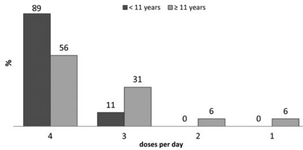
FIGURE 1: Number of self-reported daily cysteamine (Cystagon®) doses by patient age.

The impact of the disease on quality of life (QOL) was reported to be greater in adults than in children. Thus, 62% of affected adults complained of feeling different, 39% expressed professional limitations, 31% required job absences and 8% referred to compromised social life and rejection, whereas in patients under 18 years old, cystinosis negatively influenced school attendance (29%), learning ability (5%) and social life (14%), but only 10% reported feeling different.