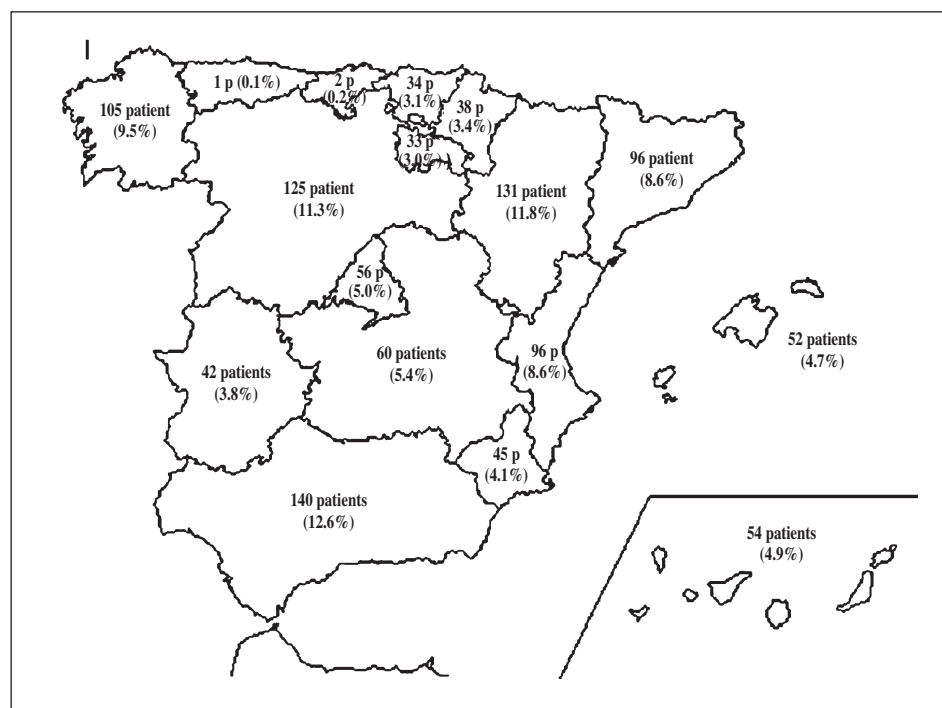
Fig. 1.—Regional distribution of patients in the study.

This observational, multisite study was carried out in 35 Spanish hospitals at all levels of care (fig. 1). The inclusion criteria were: patients 65 years of age or older, hospitalized in internal medicine units within the last 24-72 hours, with a diagnosis of any type diabetes mellitus prior to admission. All cases were consecutively included between May 2007 and May 2008. Those patients who refused to participate in the data