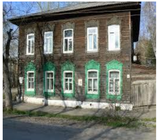
Figure 3. Building made of wood in Аникино

The results were compared to a rural settlement (Аникино) where the construction materials was mostly made from wood.