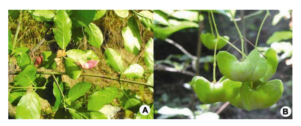
Fig. 1. Euonymus leiophloeus; a) Habit, B) Capsule

Flowering period: April to June. Fruiting period: August to September.