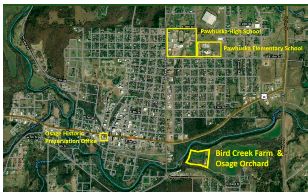
Figure 1. Aerial image of the town of Pawhuska shows the relationship of the Osage Orchard to other important community features.

The design for the orchard was developed by a team that included most of the authors of this paper, along with input from other experts. The site for the orchard was adjoining Bird Creek Farm, located in the southeast portion of Pawhuska, approximately 1.5 km from the schools and 1.1 km from the downtown area (Figure 1). The goals for the design centered around the desire to expand and diversify the production of healthy food for the community. An Osage cook, which is a respected position within the Osage community, provided guidance on the fruit and nuts that tend to be preferred by those who attend cultural events. Apples and peaches fit into that category. Other species were selected based on their cultural relevance, particularly considering edible products that were historically gathered by the Osage during the period when the tribe inhabited the land we now call Missouri, and surrounding areas. Emphasis was placed on species that have the greatest benefits for human health, including nutrient-dense berries and heart-healthy nuts. Finally, an important goal was for the design to be practical and utilitarian in terms of managing the trees for production over time. For this aspect, spacing the tree rows to allow for mechanized equipment was the primary consideration.