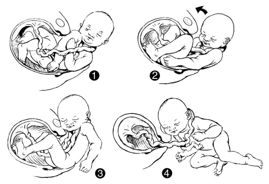
Figure 2. Somersault maneuver. The summersault maneuver involves holding the infant's head flexed and guiding it upward or sideways toward the pubic bone or thigh, so the baby does a "somersault," ending with the infant's feet toward the mother's knees and the head still at the perineum.