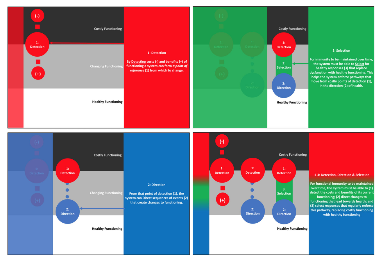
Fig. 2 The path of precision. This model of health demonstrates how precision functions integrate to organize immunity. Functional precision organizes variation. Functional variation can be maintained when functional precision detects, directs and selects for healthy change. When integrated, the precision functions serve health from multiple levels.

biological and behavioral immune systems can be helpful when creating messaging about population health. The tangible parallels among biological and behavioral immune systems can be helpful when tailoring intervention-messages to populations. For example, not all in the population can immediately understand the function of immune receptors. However, more in the population will be ready to understand how interventions support their ability detect the pros and cons, the costs and benefits, of changes in health. When creating messages about the important steps towards population immunity, researchers can use the logic to explain interventions: