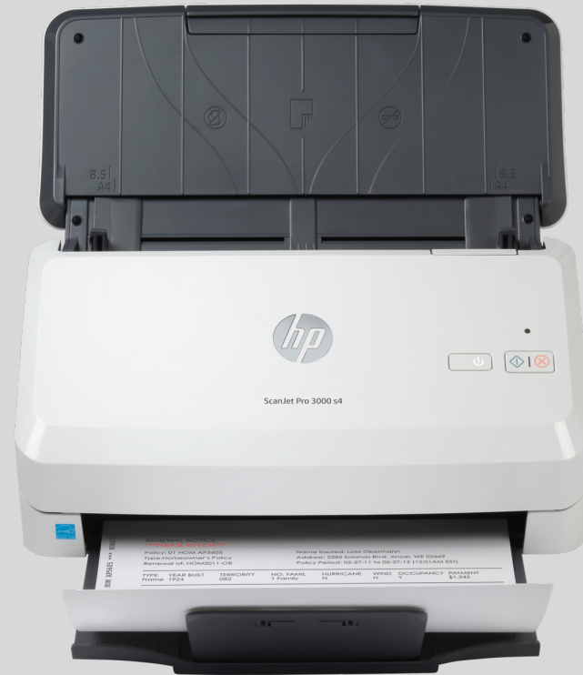
HP Scanjet Pro 3000 s3