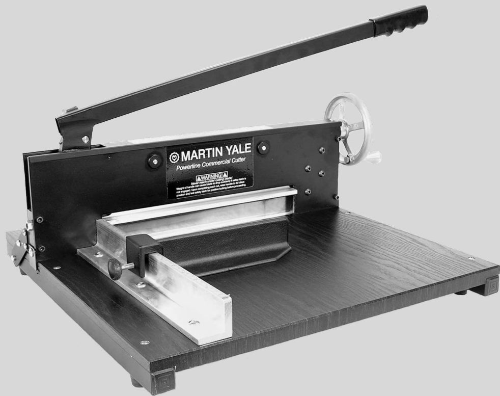
Martin Yale 7000e