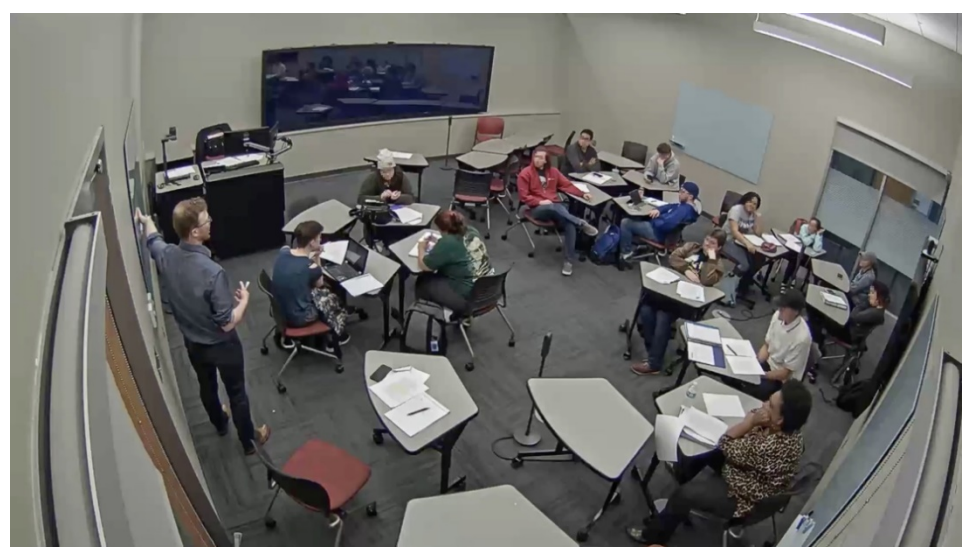
Figure 5. Small-group discussion using paper copies of Dush's (2015) "When Writing Becomes Content" with instructor-facilitated input at whiteboard.

Following the small-group discussion activity, students suggested websites that they might analyze using the key terms they identified. Guided by students' comments, the instructor displayed websites on the screen and then revealed one website's source code (demonstrating its "nature as digital data") and examined another's social media sharing features (exploring the website content's "fluidity in terms of... shape"; Dush, 2015, p. 176). With each key term, attention was drawn from the page (where students took notes) to the screen (where examples were shown and manipulated) and back as students participated in a multimodal engagement with course concepts (see Figure 6).