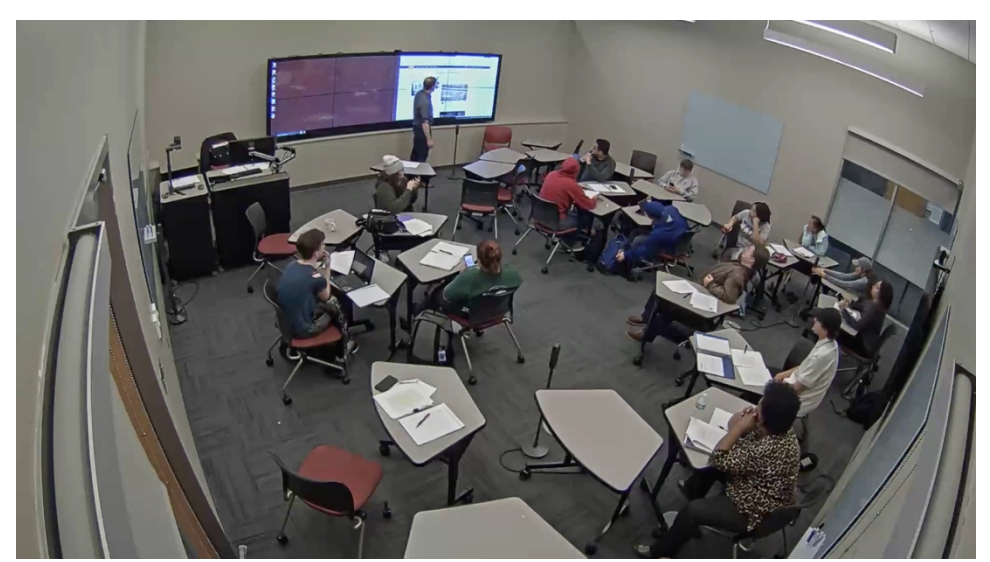
Figure 6. Use of interactive video wall to apply key terms to student-suggested examples.

Following the small-group discussion activity, students suggested websites that they might analyze using the key terms they identified. Guided by students' comments, the instructor displayed websites on the screen and then revealed one website's source code (demonstrating its "nature as digital data") and examined another's social media sharing features (exploring the website content's "fluidity in terms of... shape"; Dush, 2015, p. 176). With each key term, attention was drawn from the page (where students took notes) to the screen (where examples were shown and manipulated) and back as students participated in a multimodal engagement with course concepts (see Figure 6).