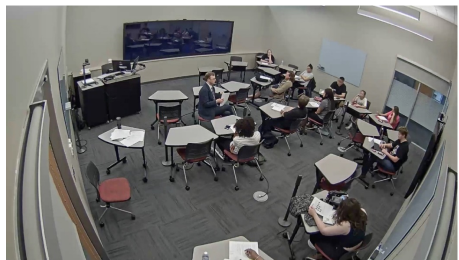
Figure 2. Students face the instructor and interactive video wall at the start of class.