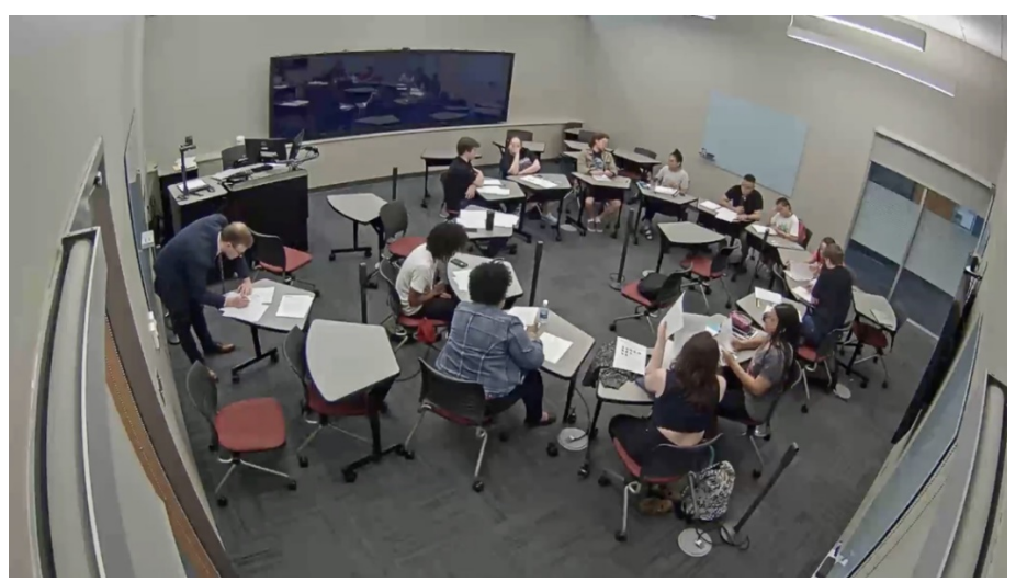
Figure 4. Students turn to work with partners to reflect on seminar discussion.