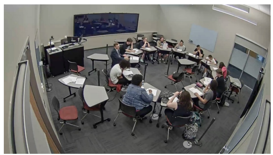
Figure 3. Room arrangement configured to facilitate seminar discussion on student texts.