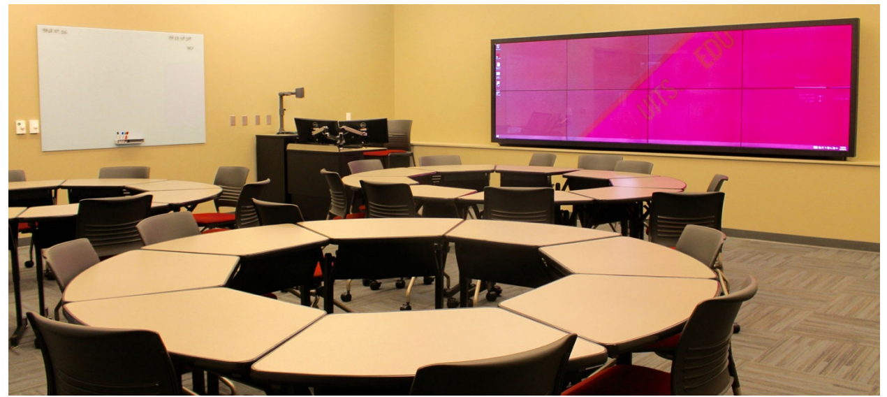
Figure 1. The Active Learning Classroom.

A second context shaping design choices of the instructor was the physical learning space itself.