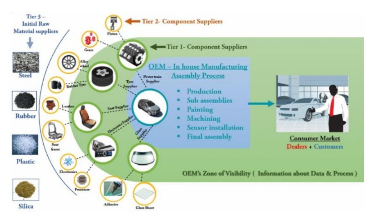
Figure 2. Typical Automotive Supply Chain (Reddy, et. al, 2021).

This is a graphical representation of three tiers of the ASC; starting at the tier 3 initial raw material suppliers, to tier 2 component suppliers, to tier 1 component suppliers and eventually the consumer market (consisting of dealers and customers).