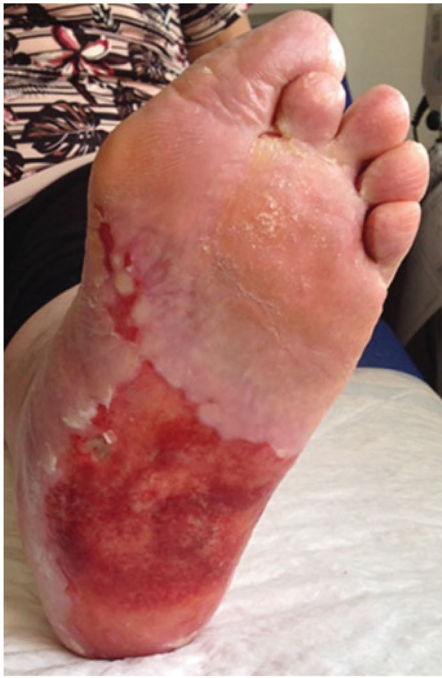
Figure 1. Extensive, malodorous and irregular ulcer, having well-defined margins and a reddish and friable base.

Surgery was performed under local anesthesia with sedation. After surgical debridement of the plantar lesion, two 3 mm 2 skin punch biopsies were taken from the left thigh and processed through Rigenera ® at 80 rpm for 2 min in 3 ml of 0.9% NaCl saline solution, each. The resulting solution was injected on margins and bottom of the lesion ( Figure 2 ). Then, the area was covered with a 1:2 meshed split thickness skin graft taken from her left thigh, and a nonadherent gauze and sterile gauze compression dressing.