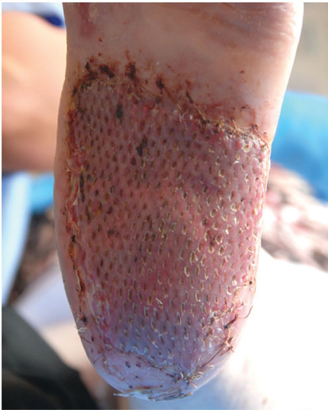
Figure 4. Skin engraftment after 14 days.

was no previous data on its use in plantar ELP. Notably, even though we did not observe complete disease resolution, we obtained partial reduction of inflammation and increase of granulation tissue, that might have favored the surgical approach.