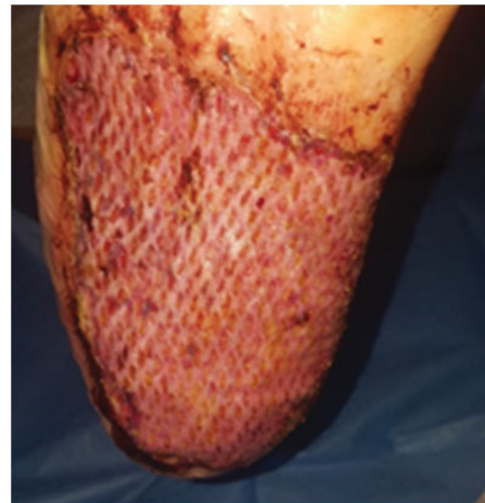
Figure 3. Skin engraftment after 5 days.

increasing need for innovative approaches. Many approaches can be used when the normal process of tissue regeneration is impaired or simply insufficient, such as grafting which includes autografts, allografts, xenografts, and biomaterial substitutes [1,2].