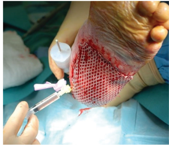
Figure 2. Injection of solution containing autologous micro-grafts obtained with Rigenera ® protocol.

The repair and regeneration of human tissues is particularly difficult and given that regenerative ability declines with increasing age. The dramatic rise in the ageing population worldwide determined an