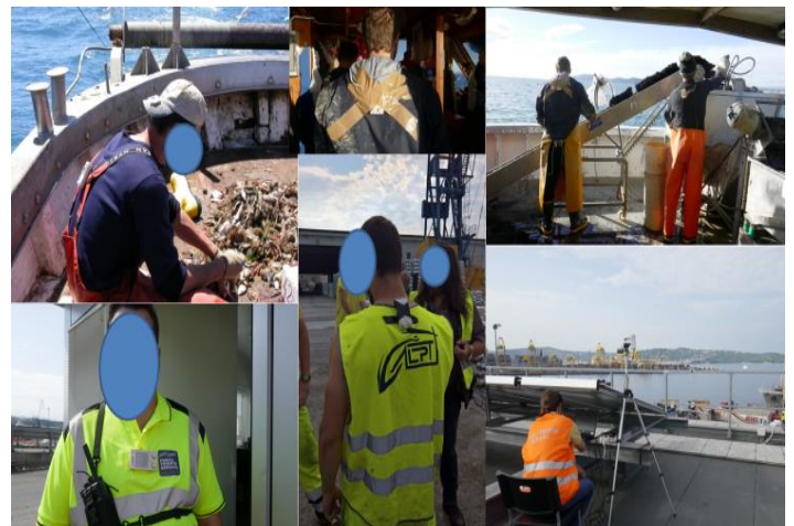
Figure 1: Placement of the UV electronic dosimeters at the workplace, on the fishermen (FM) and dockworkers (DW). From left to right, top to bottom: (1) a FM with a dosimeter on the back and one on the cap to simulate nape exposure; (2) a FM with a back dosimeter working in a covered area of the boat; (3) two FM with back dosimeters working in an uncovered area of the boat; (4) a DW working as port coordinator with a chest dosimeter; (5) a DW working as longshoreman with a