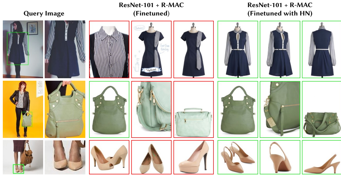
Figure 2: Top-3 retrieved results on sample query images from the Street2Shop test set. For each query, we show the top-3 results retrieved by the ResNet-101 model with R-MAC descriptors, finetuned on the dataset with and without the use of hard negatives during training. Correct and wrong retrieved elements are highlighted in green and red, respectively.

the network performance, leading to better results on almost all clothing categories. Finally, Fig. 2 shows sample query images along with the corresponding top-3 shop images retrieved by the ResNet-101 model using R-MAC descriptors and finetuned with and without the use of hard negatives in the training loss function.