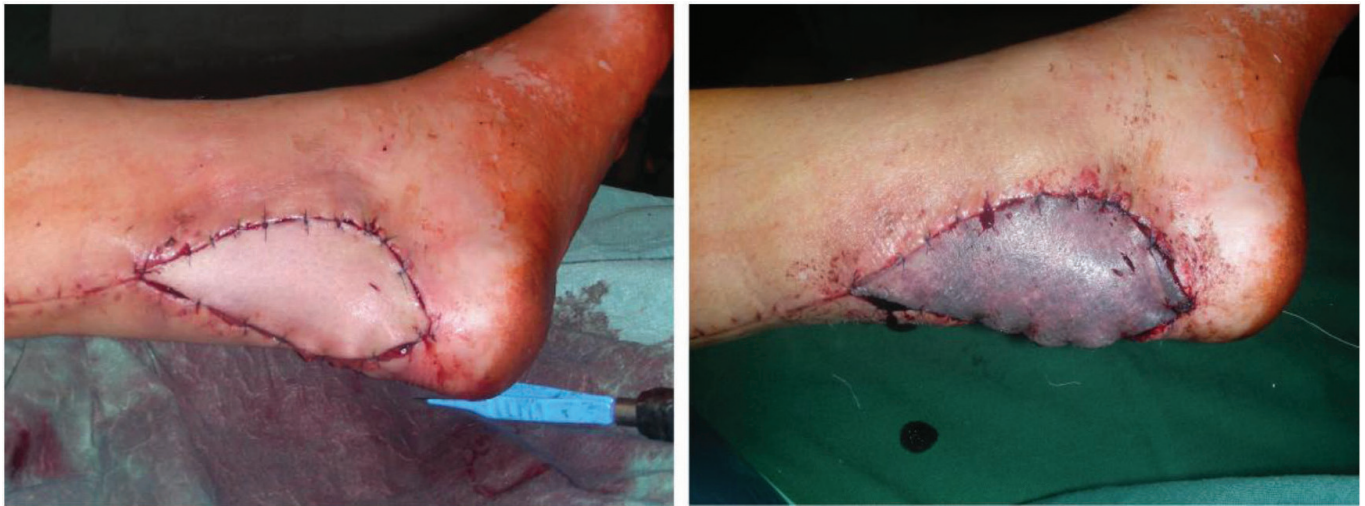
Fig. 1. Tissue defect closed with a. radialis free flap before and after microvascular flap thrombosis.

haemodynamic stability and regional blood flow. Also, blood flow in the flap can be influenced by regional anaesthesia, changes in blood volume, and vasoactive drugs (Sigurdsson and Thomson, 1995; Adams and Charlton, 2003).