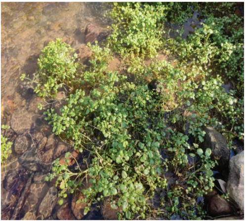
Figure 1. Aerial parts of Nasturtium officinale W. T Aiton plant, collected from Uttarakhand